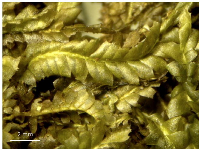
Fig. 1. – Chiloscyphus parapilistipulus Thouvenot: habit, dorsal view. [Thouvenot NC2451]

distal angles, to shallowly bifid, lobes short, widely triangular, minutely apiculate, some leaves with rounded apices. Leaf cells hexagonal, isodiametric to slightly elongate, 44–66 \mu\text{m} long, 25–52 \mu\text{m} wide, walls thin without trigone. Underleaves small, not or hardly wider than the stem, overall oval, deeply bifid, disc wider than long, 3–4 cells high, insertion line semi-circular, lateral margins with a small obtuse tooth on both sides, teeth sometimes linear, lobes erect or crescent shaped, narrowly lanceolate acuminate to linear, sinus lunate. Sexual condition dioicous. Gynoecea (unfertilized), terminal on very short intercalary ventro-lateral branches without vegetative leaves or underleaves, bracts oval, 1.2–1.8 mm long, bifid, lobes ovate acute, a lanceolate segment usually developed on the upper part of a single lateral margin otherwise entire or with rare small teeth, bracteole deeply bifid, 1.5 mm long, lobes narrowly lanceolate, more or less convergent, margins entire, perianth 2–2.5 mm long, cyathiform, smooth, mouth tri-lobate, lobes deeply laciniate. Androecea not seen.