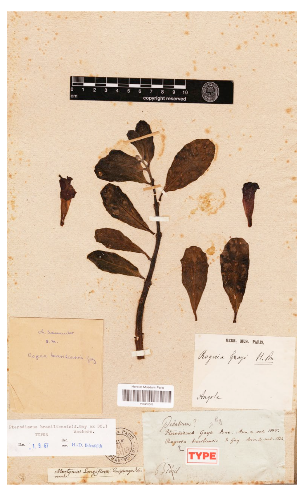
Fig. 4. — Holotype of Rogeria brasiliensis J. Gay ex DC. (≡ Pterodiscus brasiliensis (J. Gay ex DC.) Asch.) at P. [Silva s.n., P00435303]