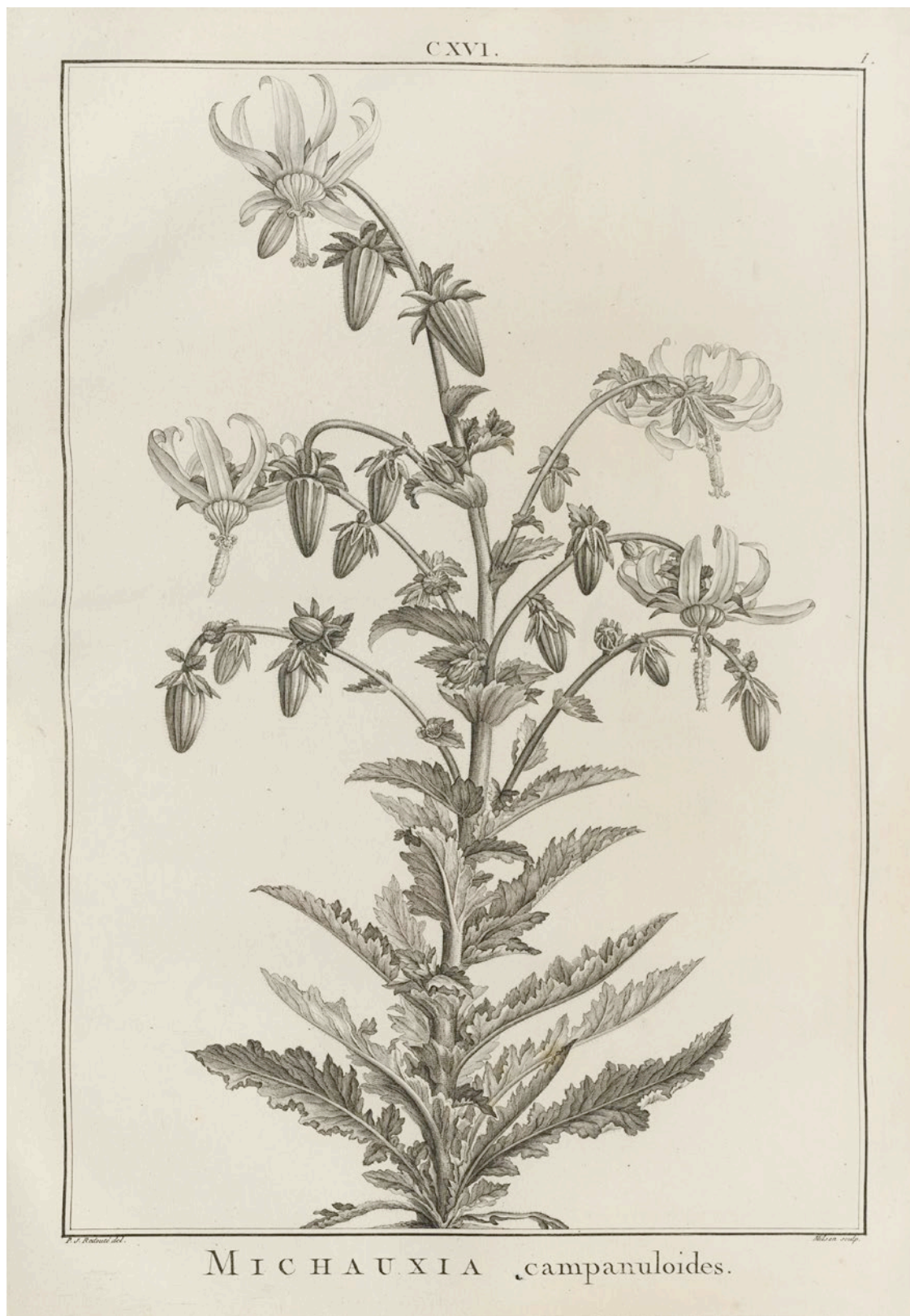
Fig. 6. – Michauxia campanuloides L'Hér. Copper engraving based on P.-J. Redouté, no date. [Tabulae ineditae: tab. 116]