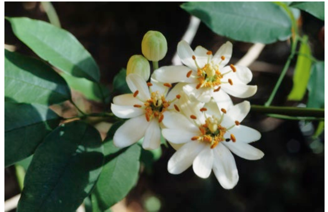
Fig. 1. – Flowers of Deidamia commersoniana DC. [Bardot-Vaucoulon 835]

Distribution and ecology. – Deidamia commersoniana is widely distributed in Madagascar throughout the eastern escarpment, from Marojejy southward to Andohahela NP, as well as in the Highlands, the Sambirano, and in the far North, from sea-level to 1200 m in humid, sub-humid, and dry bioclimatic regions. The species is also found on the island of Mayotte (Comoros Islands). It is a large liana with the main stem recorded to reach a basal diameter of 10–15 cm (PERRIER DE LA BÂTHIE, 1945) and to grow up to 8 m high (but likely much higher) in lowland to medium altitude moist evergreen and semi-evergreen forests, often collected in secondary environments and forest margins.