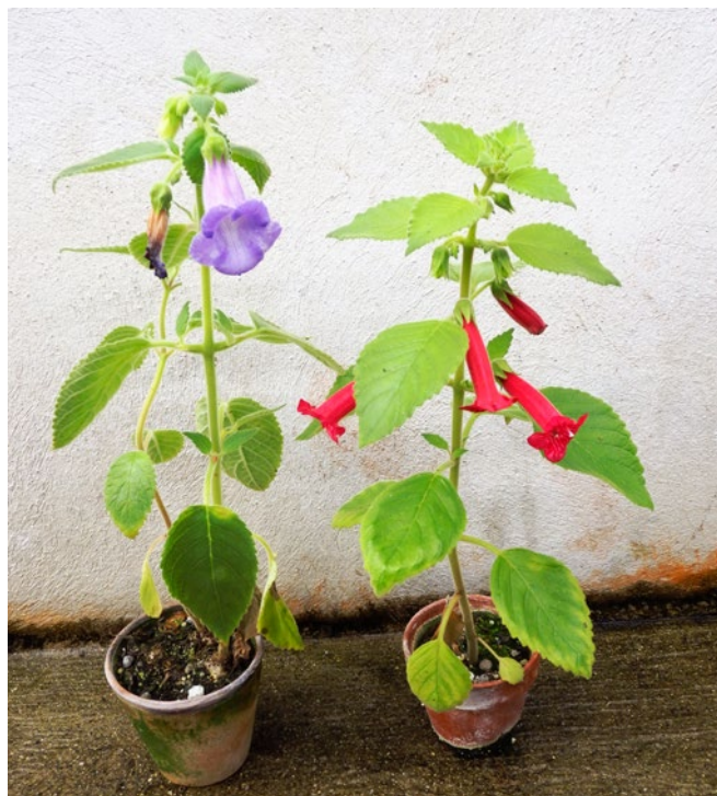
Fig. 3. – Image featuring the similar erect habit of Sinningia ganevii (left) and S. harleyi (right) and their distinct floral morphology corresponding to bee and hummingbird pollination syndrome, respectively.