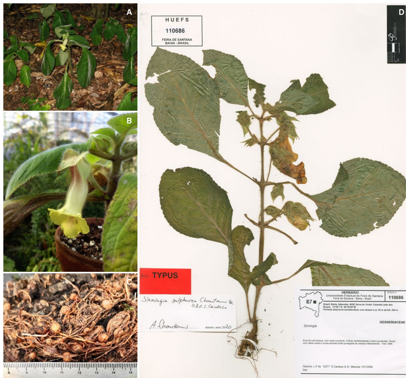
Fig. 4. – Sinningia sulphurea Chautems & D.B.O.S. Cardoso. A. Habit in the wild; B. Flower close-up; C. Underground storage system with numerous round tubers; D. Holotype at HUEFS. [A: Cardoso et al. 2066; B: cultivated in CJBG]