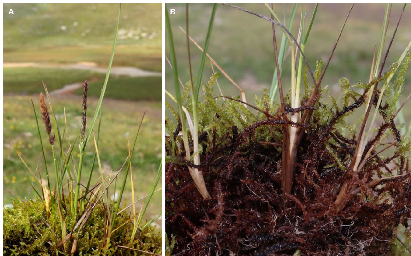
Fig. 3. – Calamagrostis lonana Eggenb. & Leibundg. A. Habit of the aerial parts with moss cushion of Warnstorfia exannulata (Schimp.) Loeske. B. Upper root space in the moss layer.

widespread calcareous sediments in the area. The examined soil profiles of Calamagrostis lonana growth sites always show a similar structure: a 10–15 cm thick moss layer (Fig. 3) is directly followed by a layer of grey alluvial loam more than 50 cm deep, intermixed with dead mosses probably from earlier inundations. The pH value remains unchanged over the entire profile depth (pH 6.5). Roots of C. lonana were found both in the moss layer (Fig. 3) and in the alluvial loam and can be detected down to a depth of about 40 cm. The root mass of Calamagrostis in a more closely examined soil sample was between 0.11 g (top layer) and 0.02 g or 0.04 g (lower layers) per 100 g of soil material. Whether during inspections at the beginning of August, in September or at the beginning of October the soil was always found to be completely water saturated.