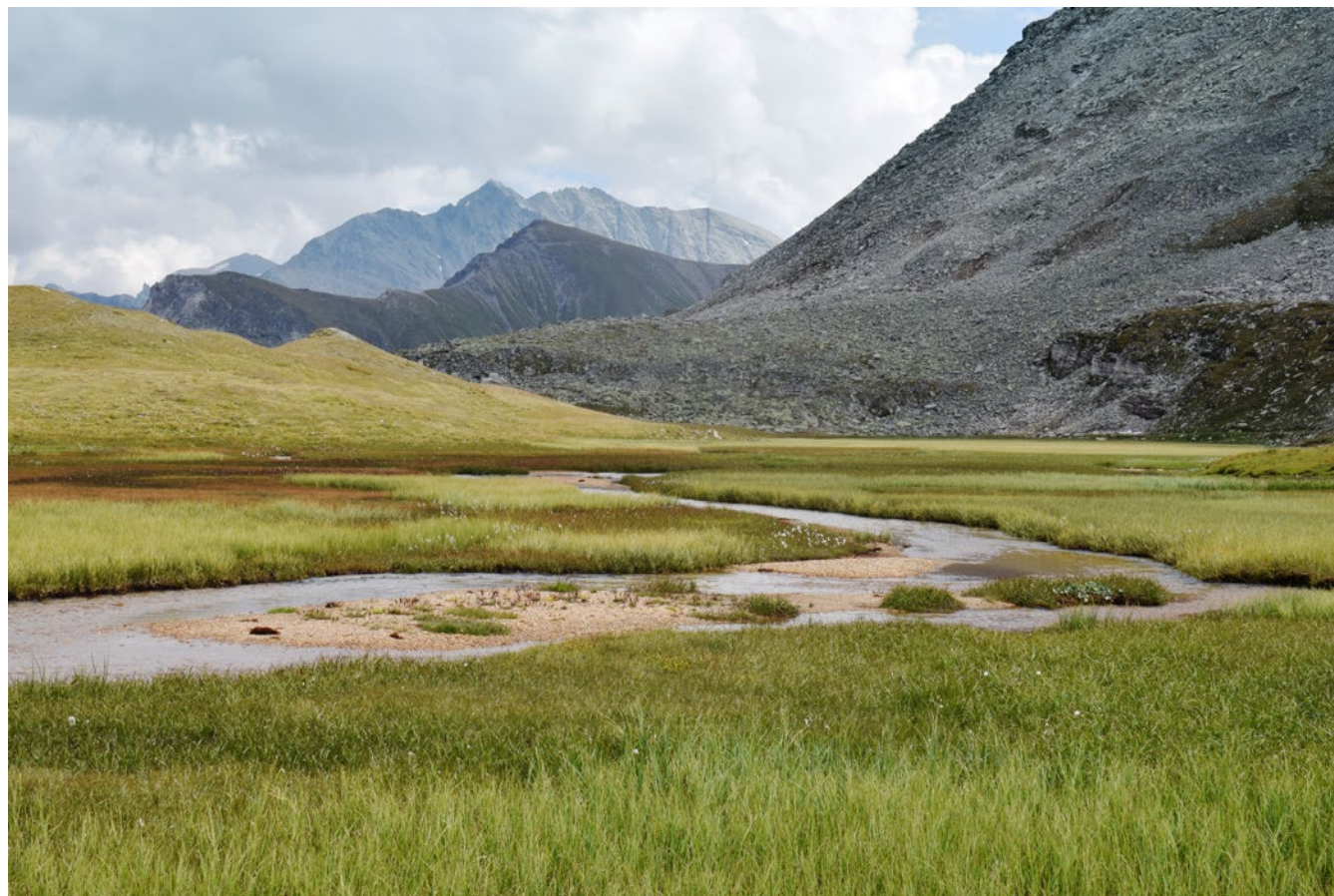
Fig. 4. – Alpine alluvial plain of Lona, with fens, alluvial and spring vegetation patches on both sides of the meandering Torrent de Lona.

Alps. Despite the tiny axillary process, SAARELA et al. (2017) place other tetraploid forms of C. stricta aggregate close to C. canescens (Weber) Roth and C. villosa (Chaix) J.F. Gmel., i.e., to species that do not possess an axial process. However, the subspecies that often shows small growth, C. stricta subsp. groenlandica , lies outside this clade (SAARELA et al., 2017), which implies a clearer delimitation from C. stricta . Further genetic studies should better resolve the C. stricta aggregate and provide more clues to the taxonomic position of the new species found in the alluvial plain of Lona.