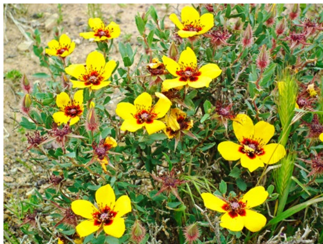
Fig. 1. – Rosa persica J.F. Gmel.

The first westerner to collect a specimen of Rosa persica was André Michaux (1746–1802), a correspondent of the Jardin du Roi and the Cabinet du Roi in Paris. He had applied in writing to Marie-Antoinette (1755–1793), Queen of France,