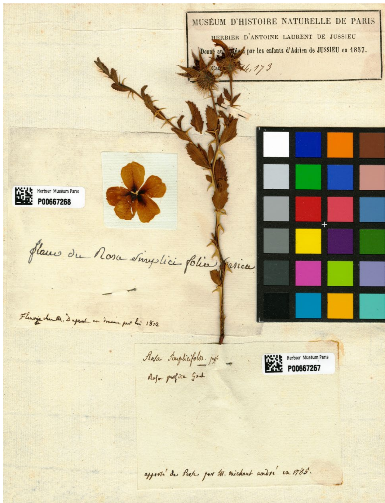
Fig. 2. – Neotype of Rosa persica J.F. Gmel.

[Michaux s.n., P-JU n° 14173 (P00667267)]