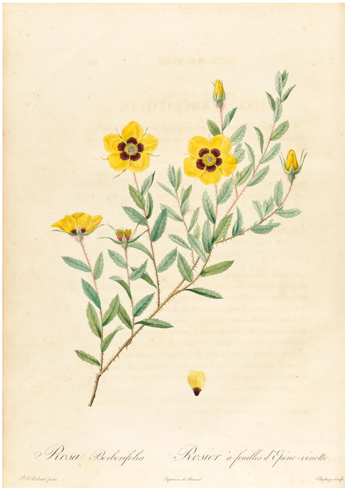
Fig. 4. – Colour stipple engraving based of Pierre-Joseph Redouté of Rosa persica J.F. Gmel. [Redouté, P.-J., Les Roses , Paris, 1817; © Bibliothèque, Conservatoire et Jardin botaniques de Genève]