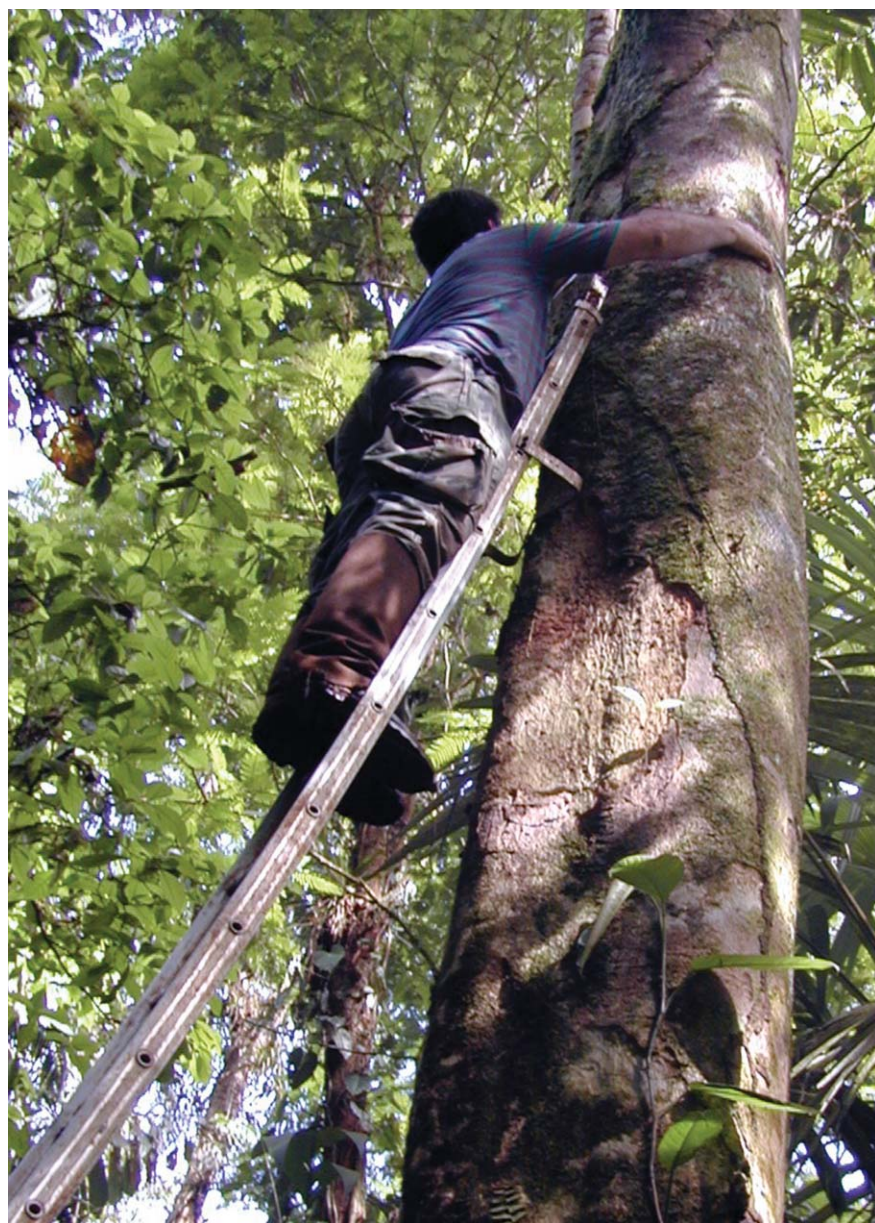
Research assistant Leo Campos measures the girth of a rainforest tree. The Clarks' controversial theory that rising temperatures slow growth in rainforest trees is based on the longest existing data set that tracks annual growth in a tropical forest. They are now in their 25th consecutive year of monitoring.

the growth of trees, and not studied net carbon exchange using eddy flux, we'd have believed our forest was a big sink for carbon, because our trees were growing like crazy—as is often true when a forest is released by having trees knocked over.”