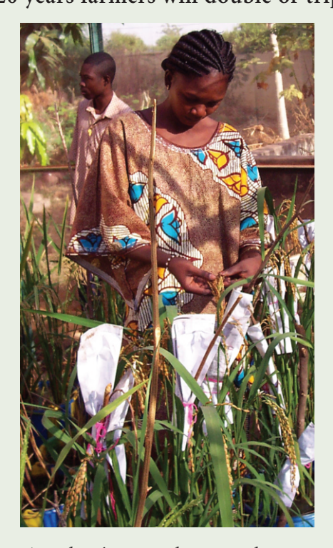
A student intern makes crosses between African and Asian rice at the Sikasso Research Center in Mali. In Africa, there is one indigenous rice species, Oryza glaberrima, which was domesticated in the northern Niger valley by Africa's first farmers. An introduced Asian species, Oryza sativa, is currently the dominant rice species in Africa.

The population of sub-Saharan Africa is growing, with about 70 percent now living in rural areas, yet African agriculture is not growing fast enough to meet the dietary needs of African communities or provide farmers with sufficient livelihoods. Numerous episodes of pre- or postharvest hunger, extreme environmental stresses such as drought and intense pest and weed infestations, and the insufficiency of global trade for African food needs further weaken the agricultural situation in Africa. In re-