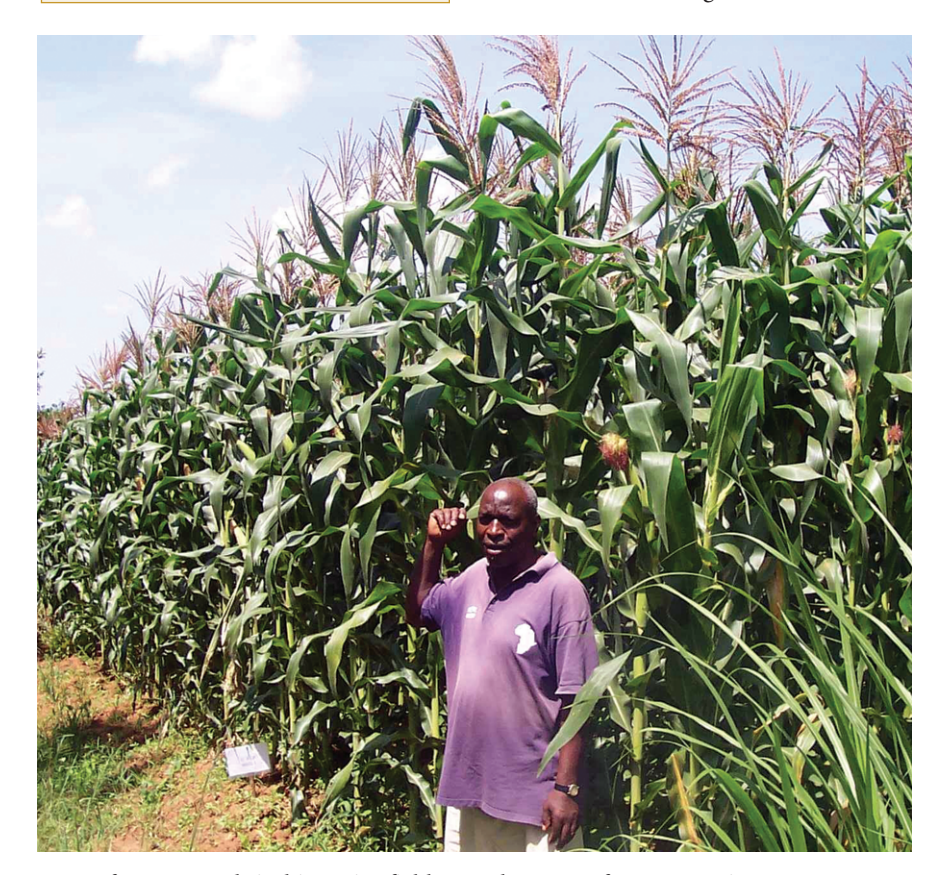
A farmer stands in his maize field near the town of Bungoma, in western Kenya. The hybrid white maize growing in this field produces about three times the average yield. It is most commonly used for porridge. Maize and cassava are the two most important crops in Africa, with the highest maize consumption in eastern and southern Africa.

Another breeder, Chrispus Oduori Adeti, focuses on finger millet in western