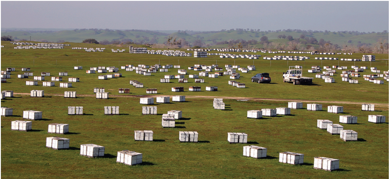
Commercial beekeeping operations may have tens of thousands of hives. Here, hives wait in a “holding yard” for transport to the almond orchards for pollination.