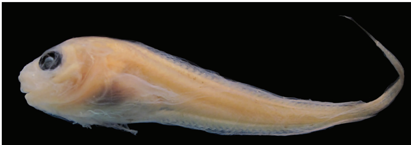
Fig. 1. Careproctus canusocius , new species, holotype, UAM 47901, 81.0 mm SL, Beaufort Sea, U.S.–Canada Transboundary waters, photographed after preservation.

Description. —Body slender, tapering posteriorly to slender tail, moderately compressed, depth at dorsal-fin origin 77.7 (72.8) % HL. Head moderately large, moderately depressed, slightly swollen nape, dorsal profile gradually sloping from nape to snout. Snout rounded, projecting beyond upper jaw. Mouth inferior, moderate in size, maxilla 52.6 (42.6) % HL,