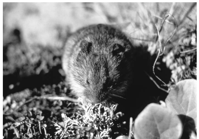
Fig. 1. —An adult Microtus miurus miurus from Alaska.