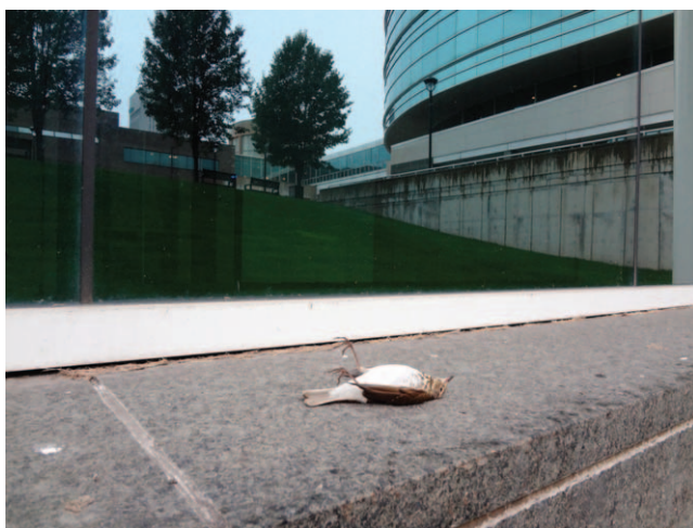
FIGURE 1. A Swainson's Thrush killed by colliding with the window of a low-rise office building on the Cleveland State University campus in downtown Cleveland, Ohio.

We reviewed the published literature on bird–building collisions and also accessed numerous unpublished datasets from North American building-collision monitoring programs. We extracted >92,000 fatality records—by far the largest building collision dataset collected to date—and (1) systematically quantified total bird collision mortality along with uncertainty estimates by combining probability distributions of mortality rates with estimates of numbers of U.S. buildings and carcass-detection and scavenger-removal rates; (2) generated estimates of mortality for different classes of buildings (including residences 1–3 stories tall, low-rise non-residential buildings and residential buildings 4–11 stories tall, and high-rise buildings \geq 12 stories tall); (3) conducted sensitivity analyses to identify which model parameters contributed the greatest uncertainty to our estimates; and (4) quantified species-specific