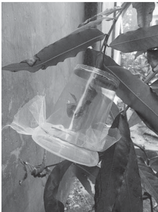
Fig. 1. Thrips cage used in studying the life cycle of Crotonothrips polyalthiae on Polyalthia longifolia .

as described above (Fig. 1). Ten 3-month old P. longifolia trees were used in this study and two cages were used on each tree. The cages were opened every 24 h to check the condition of the adults (alive or dead) and the presence of natural enemies and thrips larvae. Adult longevity was determined by counting the number of days from when the thrips were placed onto the leaves until they died. Dead adults were collected in a small vial with 70% ethanol for checking whether they were females or males under a microscope. Every newly formed larva was counted and recorded and then removed from the gall. Two weeks after both adults died, the number of unhatched eggs in each gall was counted under a dissecting microscope (50 to 100X). The percentage of hatching eggs was calculated using the following formula: