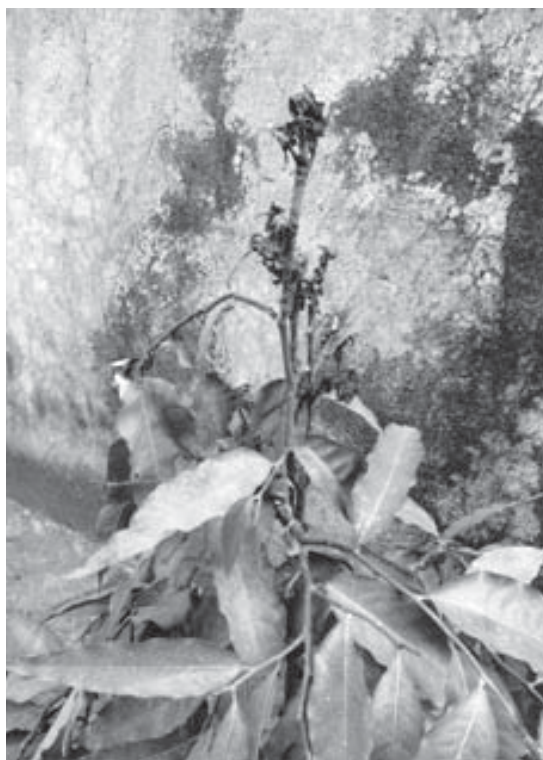
Fig. 4. A 6-month old Polyalthia longifolia plant severely damaged by Crotonothrips polyalthiae .

The presence of this leaf-galling thrips significantly affected plant height, stem circumference, and the number of healthy young leaves produced by the experimental plants (Table 3). Pre-treatment observations showed that there were no significant differences in plant height, stem circumference, and the number of uninfested young