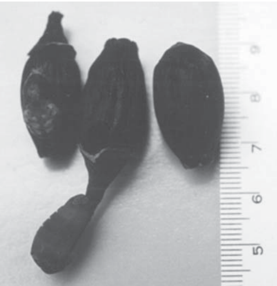
Fig. 3. Larva of Thepytus echelta (Lycaenidae) on the peduncle of Psittacanthus acinarius (Loranthaceae) fruit.

only species that expressed some potential for use as a biological control agent against this mistletoe. This is because the caterpillars produced a hole in the pericarp of the fruit to reach the seeds that indeed they did eat, thus eliminating the cotyledons and the viscin. Because of this behavior T. echelta may completely impede seed germination. However, their population during the period of the survey was very low (Table 2). Of all insect species reared on P. acinarius fruits, the most abundant (78.1%) and frequent was N. pantanense (Table 3). All lonchaeines were observed eating the fruit epicarp, but a bioassay conducted in the laboratory showed that no species of Lonchaeidae directly affected the seed germination of this mistletoe.