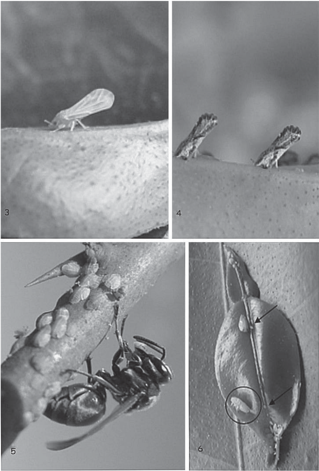
Figs. 3-6. 3. A non-melanized Diaphorina citri adult showing its characteristic white color, 4. Melanized adults of D. citri , 5. Brachygastra mellifica feeding on D. citri nymphs, and 6. Size comparison between a 1st instar (arrow) and a 5th instar (circled) D. citri nymph at Río Bravo, Tamaulipas, México.