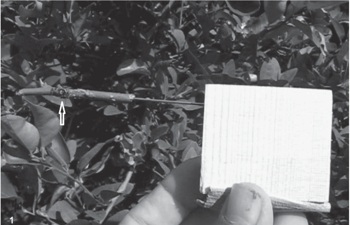
Fig. 1. Brachygastra mellifica (indicated by the white arrow) feeding on Diaphorina citri on a lemon petiole secured with a short length of wire to square wood block.

practically passed over as a prey (Table 1). The time taken to consume 1 of these very immature developmental stages was 6 \pm 1 seconds (Fig. 2). In contrast when B. mellifica wasps were exposed to 2nd and 3rd instars a great increase in consumption per wasp occurred. Thus individual wasps consumed up to 42 second and third instar nymphs, and spent 17 seconds to predate each one (Fig. 2). Further one wasp was able to consume up to 27 fourth or fifth D. citri instars in 14 min, averaging 31 \pm 2 seconds per nymph (Fig. 2); in some cases up to 37 seconds were required to consume 1 nymph, but others were consumed in less than 20 seconds. On most occasions B. mellifica consumed the entire prey. These developmental stages most preferred by B. mellifica were fourth and fifth instars (Table 1).