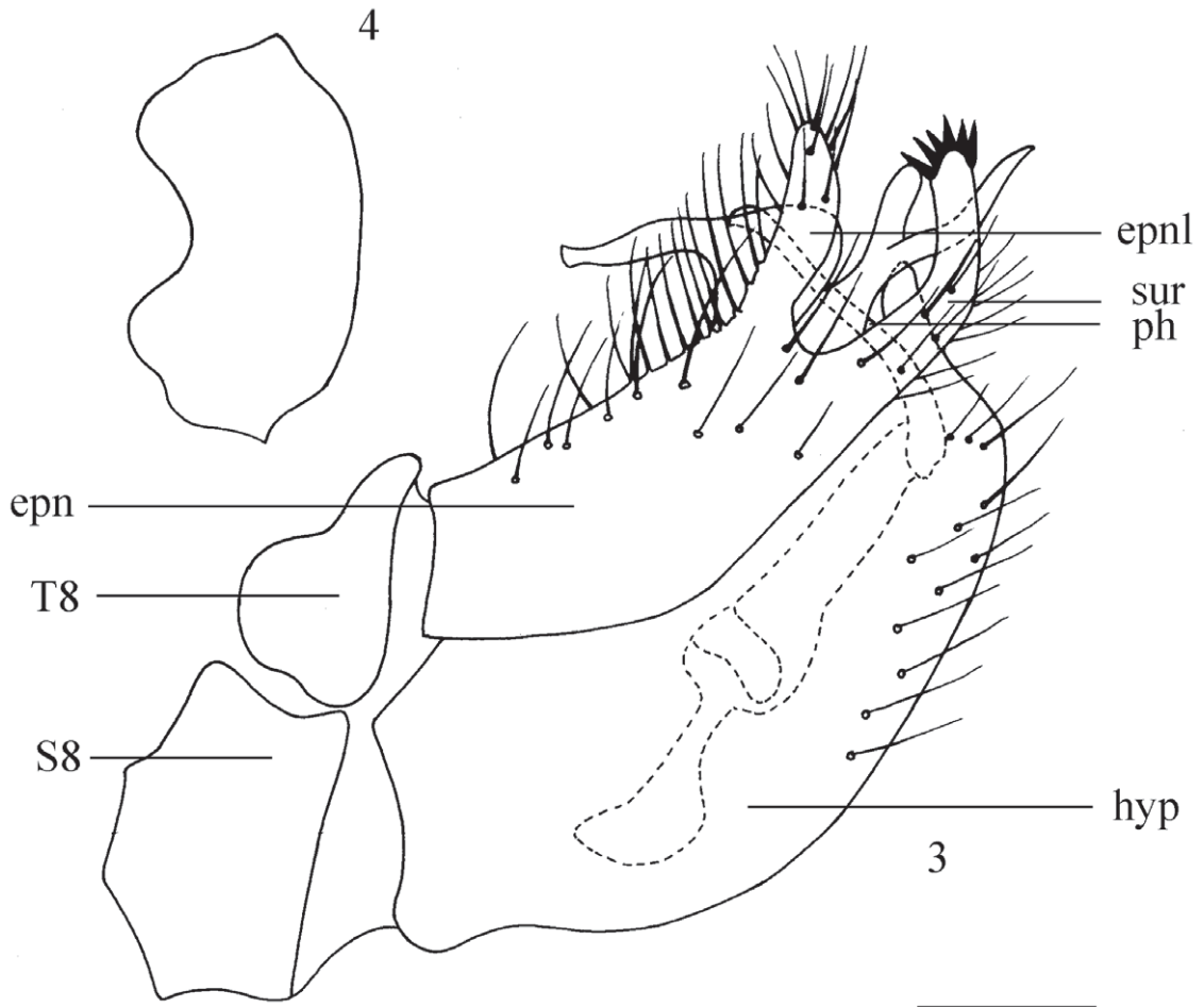
Figs. 3 and 4. Heleodromia ( Neoilliesiella ) orientalis sp. nov. (male). 3. Genitalia, lateral view; 4. Tergite 8, dorsal view. Abbreviations: epn = epandrium; epnl = epandrial lobe; hyp = hypandrium; ph = phallus; s8 = sternite 8; sur = surstylus; t8 = tergite 8. Scale bar = 0.1 mm.

Abdomen black with pale gray pollinosity; hypopygium partly brownish yellow. Setulae and setae on abdomen dark yellow except hypopygium with some blackish setulae and setae.