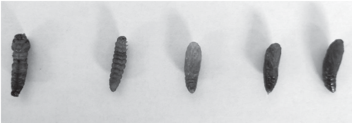
Fig. 2. Pre-pupae and pupae of Melitara prodenialis reared on artificial diet.

sequent generations become adapted to laboratory rearing conditions.