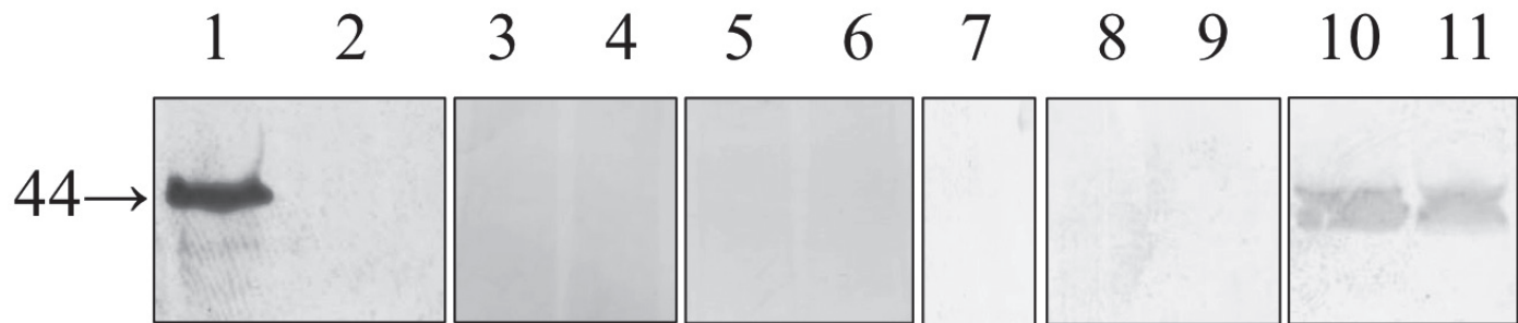
Fig. 1. Representative western blot analyses to detect the presence of SINV-3 capsid protein (VP2) in different ant species. Lane assignments are as follows: 1) purified SINV-3; 2) S. invicta negative control colony; 3,4) S. aurea ; 5,6) S. xyloni ; 7) S. carolinensis ; 8,9) S. molesta ; 10,11) S. invicta positive control colonies. Molecular retention indicated as kDa.

nopsis , did not support replication of SINV-3. Western blot analysis produced distinct bands for the viral capsid protein (VP2, see Fig. 1) in all 4 of the treated S. invicta colonies (Table 1) indicating that the virus was replicating. Furthermore, all 4 treated S. invicta colonies had stopped growing by the end of the test (Table 1) and contained either no brood (3 colonies) or only a trace of brood (1 colony). In contrast, the capsid protein (see Fig. 1) was not detected in the 3 treated S. aurea colonies or the 2 species of thief ants (Table 1) confirming the lack of viral replication in these ants. The capsid protein was also not found in 3 of the 4 untreated S. invicta colonies (see Fig. 1; the 4th colony was not tested because of space limits, Table 1). After 7 wk, 3 of the 4 S. invicta control colonies and all of the S. aurea colonies contained large amounts of brood and had at least doubled in weight (Table 1). Brood production had stopped in 1 of the untreated S. invicta colonies and 1 of the S. molesta colonies (Table 1), but neither colony contained capsid protein evidence of replicating virus. The S. carolinensis colony and the other S. molesta colony remained healthy with large amounts of brood. Four months later, all of the S. aurea colonies, the S. carolinensis colony, and the one S. molesta colony remained healthy.