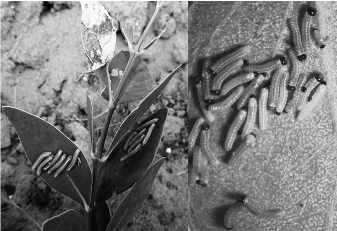
Fig. 1. Aggregation of Colotis amata on a pilu plant ( Salvadora persica ) during the winter season at the ICAR Central Institute for Arid Horticulture, Bikaner, India.