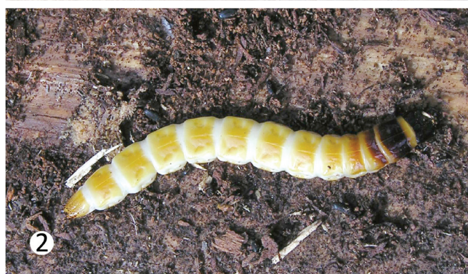
Figs. 1 and 2. Alaus melanops LeConte, 1863. 1, Adult (habitus, dorsal); 2, larva (habitus, dorsal).

Department of Invertebrate Biology, Evolution and Conservation, Institute of Environmental Biology, Faculty of Biological Science, University of Wrocław, Przybyszewskiego 63/77, PL-51-148 Wrocław, Poland