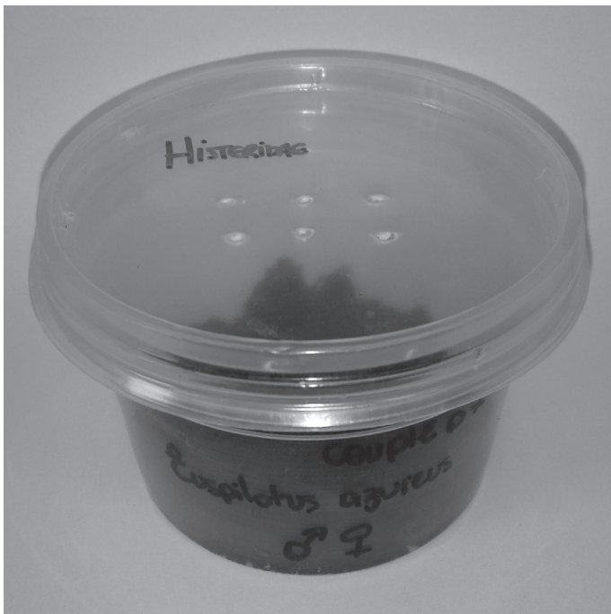
Fig. 1. Experimental arena (250 ml pot) containing 200 g of sifted commercial topsoil, where Euspilotus azureus were paired under controlled conditions (15, 20, 25, and 30 °C; photoperiod 12:12 h L:D; RH 65 \pm 10\% ).