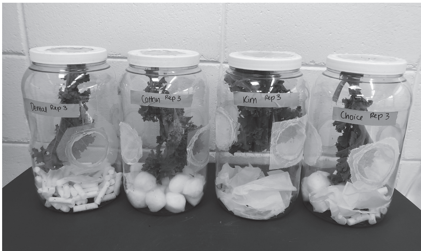
Fig. 1. Large cages for no-choice and choice tests for evaluating the preference of Bagrada hiliaris for 3 artificial oviposition substrates: dental wicks, cotton balls, or Kimwipes.

There is a risk that Bagrada hiliaris will be transported from the southwestern USA and establish in Florida where it could infest Brassi-