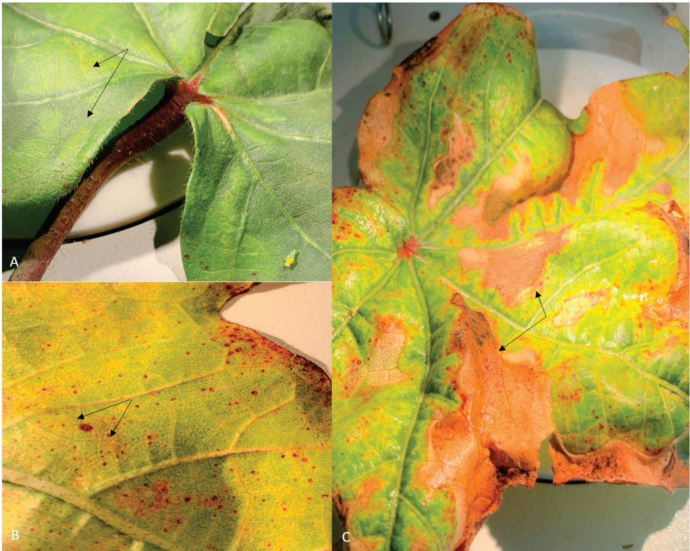
Fig. 1. Damage of Amrasca biguttula in cotton leaf: A) chlorosis and discoloration, B) reddening point, and C) burn areas.

L. [Malvaceae], eggplant ( Solanum melongena L. [Solanaceae]), cowpea ( Vigna unguiculata L. [Fabaceae]), pigeon pea ( Cajanus cajan Mill-sp. [Fabaceae]), potatoes ( Solanum tuberosum L. [Solanaceae]), millet ( Sorghum sp. [Poaceae]), maize ( Zea mays L. [Poaceae]), and sunflower ( Helianthus annuus L. [Asteraceae]) and is reported to have many additional ornamental hosts in its native range in Asia such as china rose ( Hibiscus rosa-sinensis L. [Malvaceae]) and Bermuda grass ( Cynodon dactylon L. [Poaceae]) (Kamble & Sathed 2015; Saeed et al. 2015). The genus Gossypium , from which cultivated cotton was domesticated, is native to both the Eastern and Western Hemispheres; however, the genus Amrasca is endemic to the Indomalayan region (Dmitriev et al. 2022). Due to the widespread cultivation of cotton, this non-native species ( A. biguttala ), when introduced to a new site, may have the potential to reproduce and disperse without control, potentially causing significant economic impact. Perhaps the observed increase of this pest in the reported crops is because it does not have local natural enemies, as predicted by the enemy release hypothesis (Middleton 2008). There is the potential for this to occur in Puerto Rico, with additional challenges unique to island ecosystems.