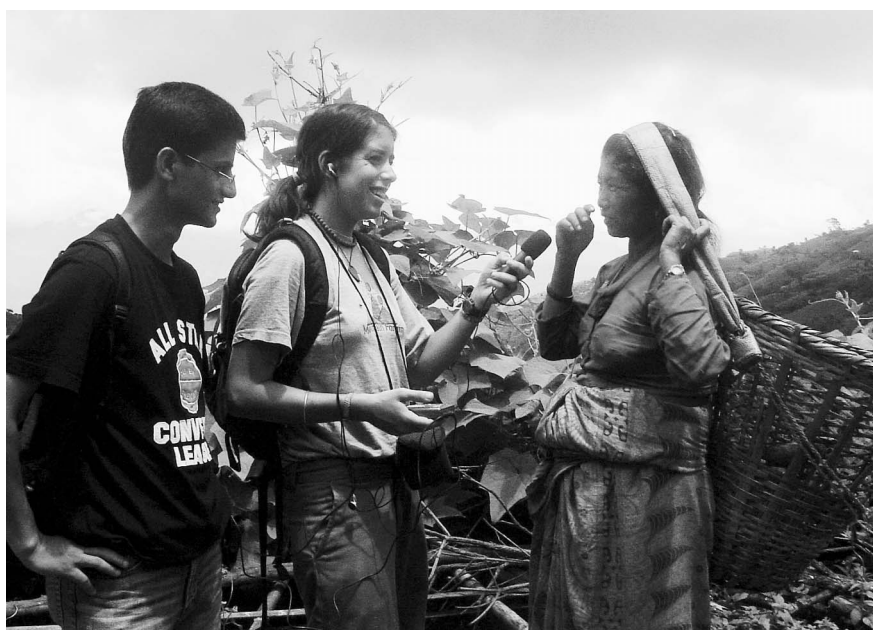
FIGURE 1 Interviewing a Tamang woman. Bhojeni, Kathmandu District, Nepal.

In the first phase, 8 such programs will be produced. As this is a pilot phase, the purpose is to assess whether such an approach—which