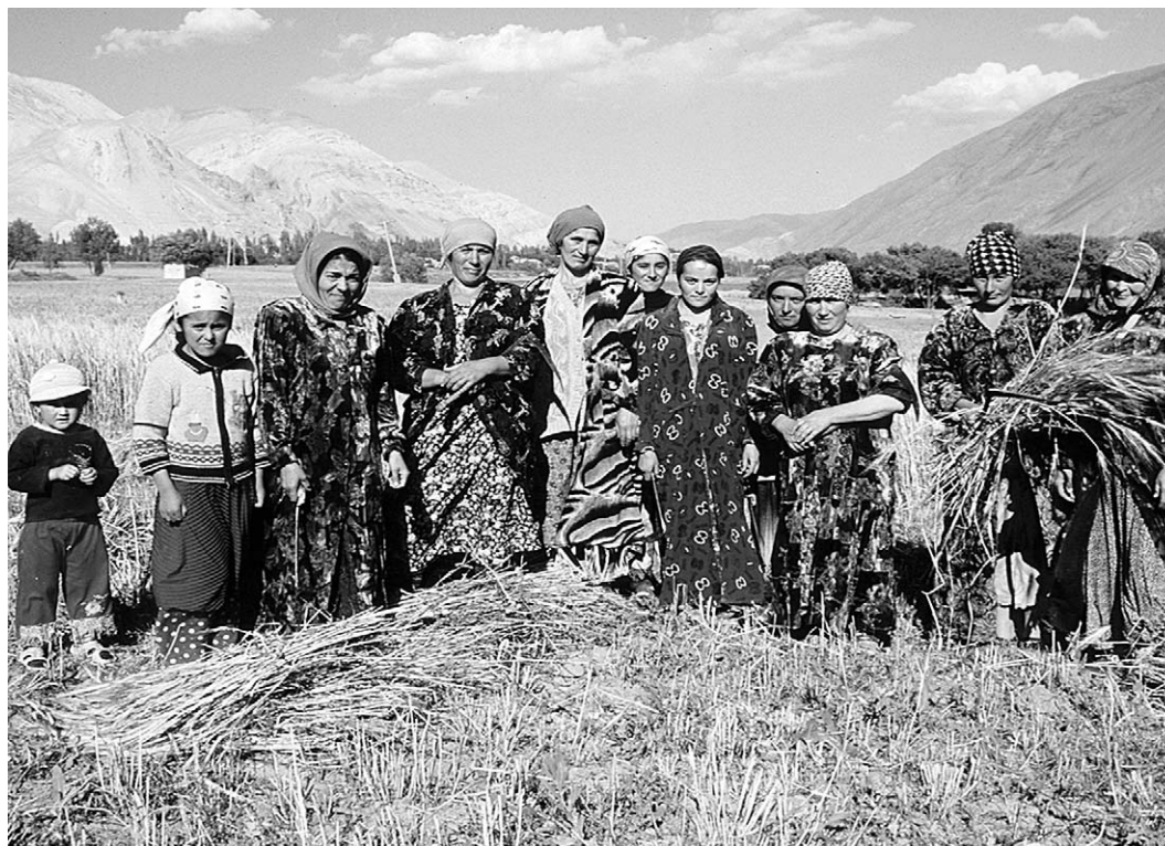
FIGURE 3 If empowered and informed, Muslim women in Tajikistan as well as elsewhere in mountainous Central Asia can play a key role in helping to redress the erosion of seismic culture.

that the Kashmir Earthquake occurred because, as many put it, “it was God’s will” and “God’s will and destiny chooses who survives and what places get destroyed.” There was also a disturbing campaign alleging that one of the reasons for the Kashmir Earthquake was women’s sins, inappropriate behavior, and dress. The lack of sound information can lead to blaming these types of events on metaphysical phenomena or social groups rather than focusing attention on the physical hazard, preparedness, and planning. When asked from where they received information regarding relief and reconstruction, the majority of respondents indicated that they had no place to go to collect such information. Nevertheless, tremendous concern exists with regard to the safety of structures and communities in the future. One 30-year-old male teacher in a local school put it this way, “this area is not safe. People are tense and tremors make people worry. Areas should be planned to be safer.”