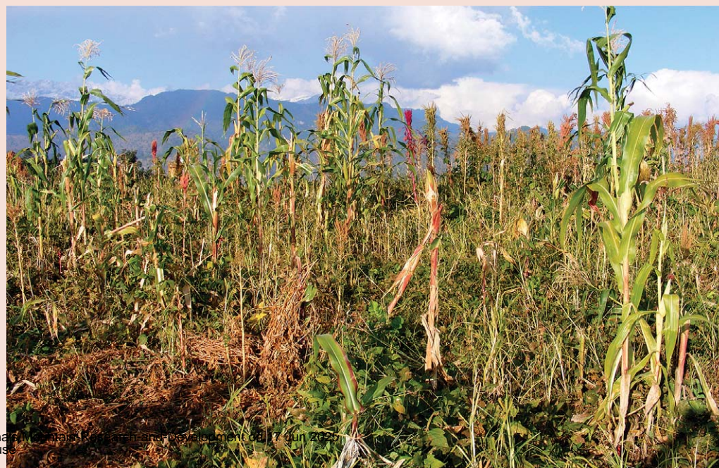
FIGURE 1 A field of monsoon crops in the study area (Baranaza), where 7 to 8 traditional crops grow simultaneously in one field.

This tradition of arduous work has inculcated the wisdom to rationally use, promote, and conserve the ecological system and biodiversity. Consequently, women have internalized the fact that conservation of the environment is a prerequisite for food security. From centuries of experience they have learned the art of