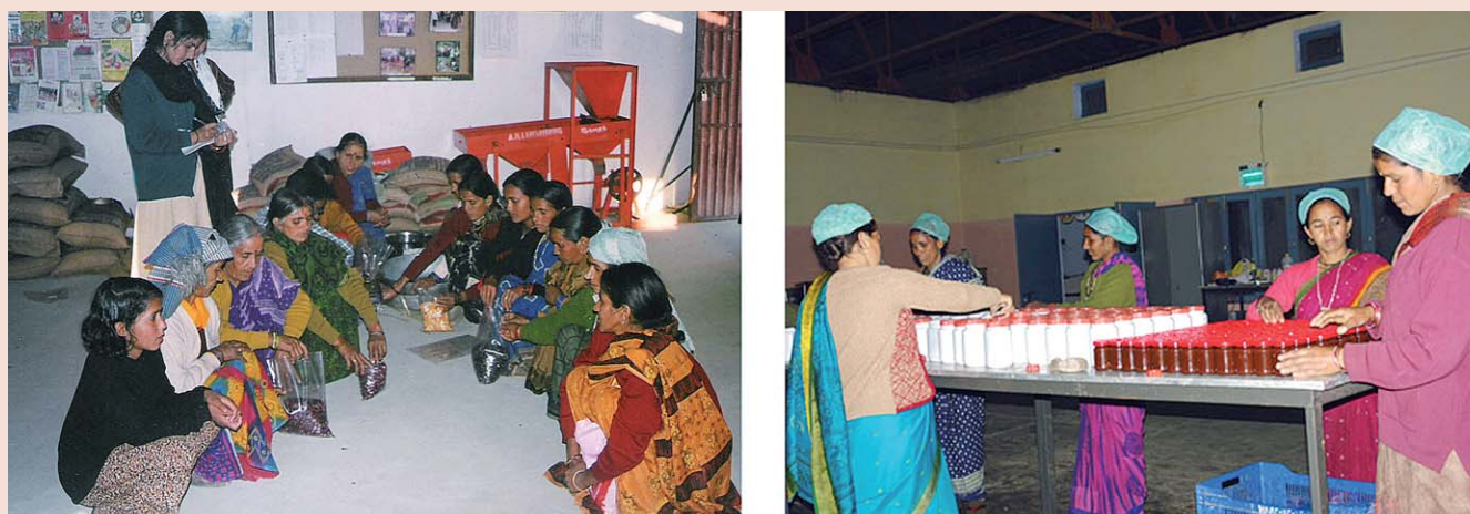
FIGURE 3 Left: members of the Rawain Women's Cooperative Federation providing advanced training on grading, packing, and processing to self-help groups. Right: members of the RWCF packing apple jam and amla pickles for marketing.

tems. Women of different SHGs were willing to take up entrepreneurship but initially were not confident of their ability to do so. An NGO working in this area, the Himalayan Action Research Centre (HARC), played an important role by providing institutional support through different programs such as creation of self-help groups (SHGs). The Rawain Women's Cooperative Federation (RWCF) was formed by HARC in the late 1990s.