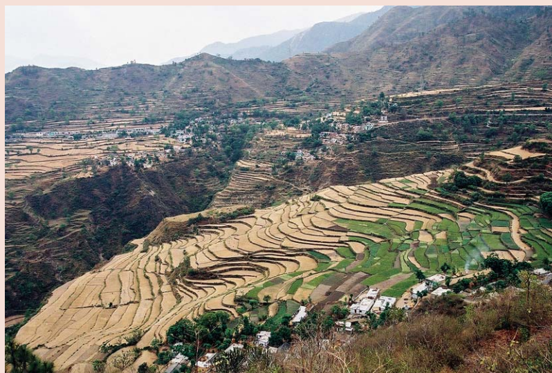
FIGURE 2 Villages in the study area (1800 m) known for traditional grain crops and pulses.

To examine the ongoing process of transformation from subsistence to market-oriented agriculture in mountain areas, specifically among women, a sample of 12 villages located between 1500–2000 m in the Yamuna valley, in the Nagaun and