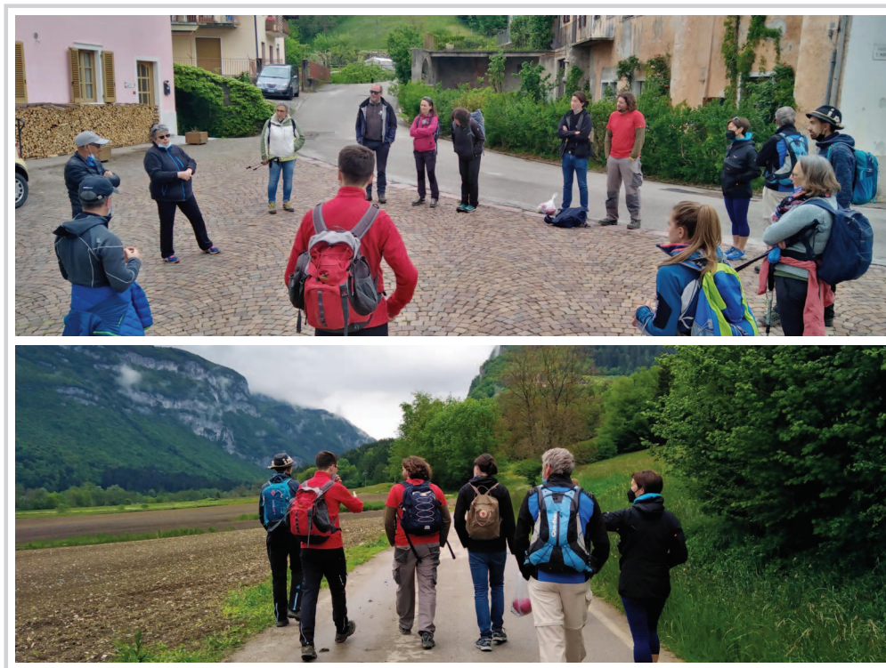
FIGURE 4 During the festival, convivial moments with the community and walks were functional to build relations with the communities and to explore collective resources and issues at stake.

Here, we briefly present the outputs of the different intervention phases and activities. The focus groups and surveys in each community were centered on identifying a variety of resources considered to be important for the community to take care of collectively; assessing how the values of these resources are changing; and envisioning their future and revitalization in the perspective of community development. Each focus group was carried out by dividing the participants into groups, each moderated by a core team member taking notes on a flipchart. Focus was placed on creating a group discussion to identify as many different resource values as possible, and to create a platform for communication among participants and discovery of these values and different interests. The reported resources and visions were interpreted according to the SESF categories (see Table S1, Supplemental material , https://doi.org/10.1659/mrd.2022.00013.1.S1 ). The resources identified in the focus