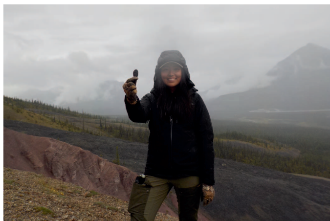
FIGURE 5 A Sahtu student holds a stone tool that she found associated with a sheep fence site on the mountain known to the Shúhtagot'ine as Pietl'ar'nejo during the 2021 field campaign for the Shúhtagot'ine Cultural Landscape Project.

Archaeological research can also evoke the “landscape memories” held within cultural landscapes. The conceptual framework that Lindholm and Ekblom (2019: 3) developed for biocultural heritage—a concept closely related to the idea of a cultural landscape—categorizes archaeological sites as landscape memories, which they define as “tangible materialized human practice and semi-intangible ways of organizing landscapes.” Landscape memories are 1 of 3 “memory reservoirs,” which also include “ecosystem memories” and intangible “place-based memories” such as place names. Lindholm and Ekblom (2019) encouraged practitioners to explore these memory reservoirs—and the linkages between them—in order to mobilize the knowledge that they hold toward contemporary landscape management. The case studies presented above wove landscape memories and place-based memories together to identify places where humans and caribou have come together over many generations. Unlocking these memories through collaborative archaeological research at fence sites has led us to recognize previously unrecorded mineral lick areas that can now be managed more effectively through available land management mechanisms. Evoking the memory of the long relationship between caribou, humans, and perennial ice in K'atieh has brought attention to the contemporary implications of the rapid decline of alpine ice patches.