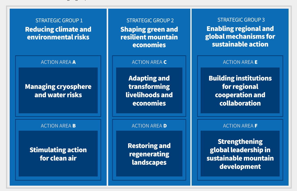
FIGURE 2 ICIMOD's 3 strategic groups and 6 action areas.