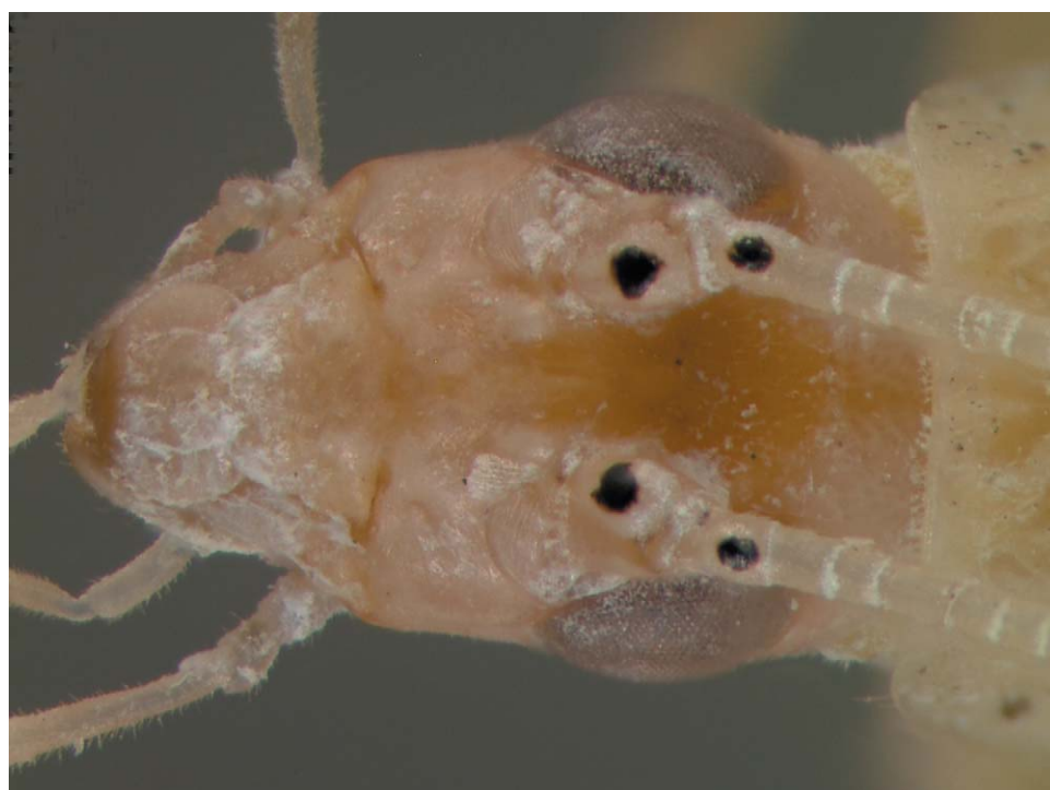
Fig. 1. Antennal markings of holotype of O. alexanderi . For color version, see Plate XIV.

In Fig. 3, the five determinations of chirp rates for Mexican O. alexanderi are by RDA as given to TW in 1966 and are from Michoacan (Tuxpan), Tamaulipas (Ciudad Victoria), and San Luis