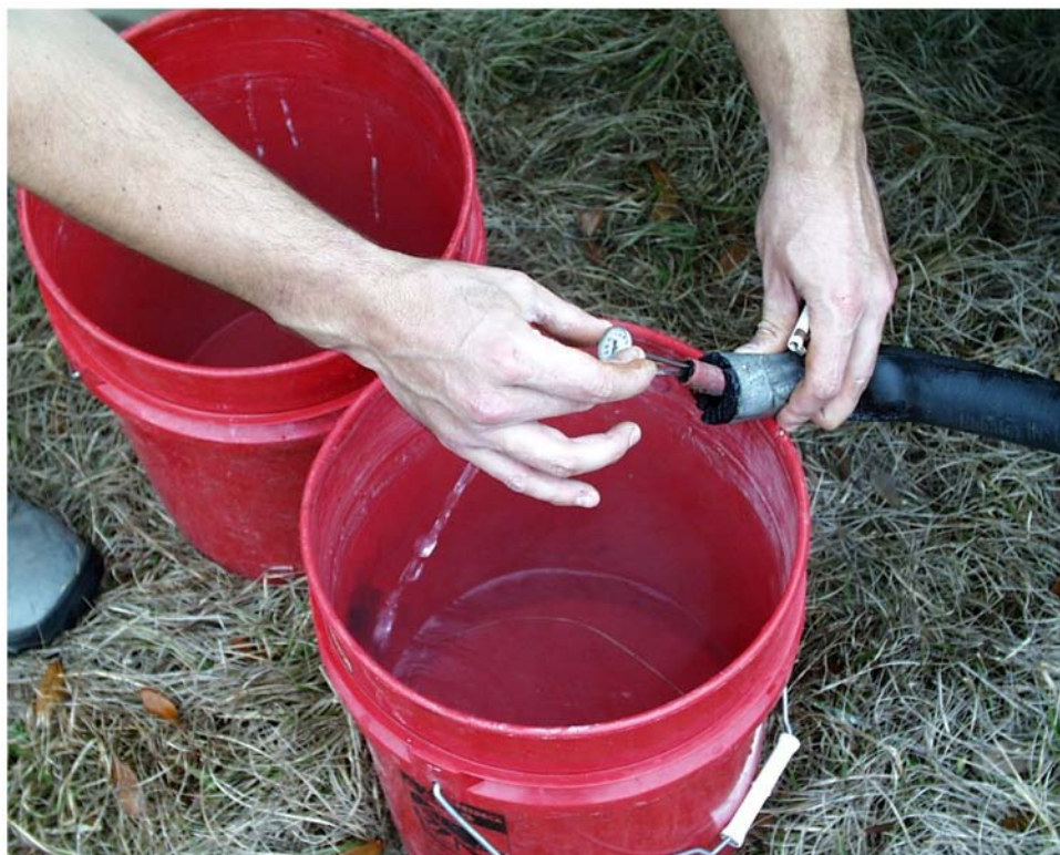
Figure 8. Measuring the temperature at the hot-water outlet. Knocking down ash and keeping the charcoal topped up assures that the effluent water temperature is always between 60° and 85° C.