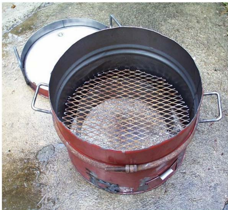
Figure 1A. Oil drum and lid, before lining with fire clay.