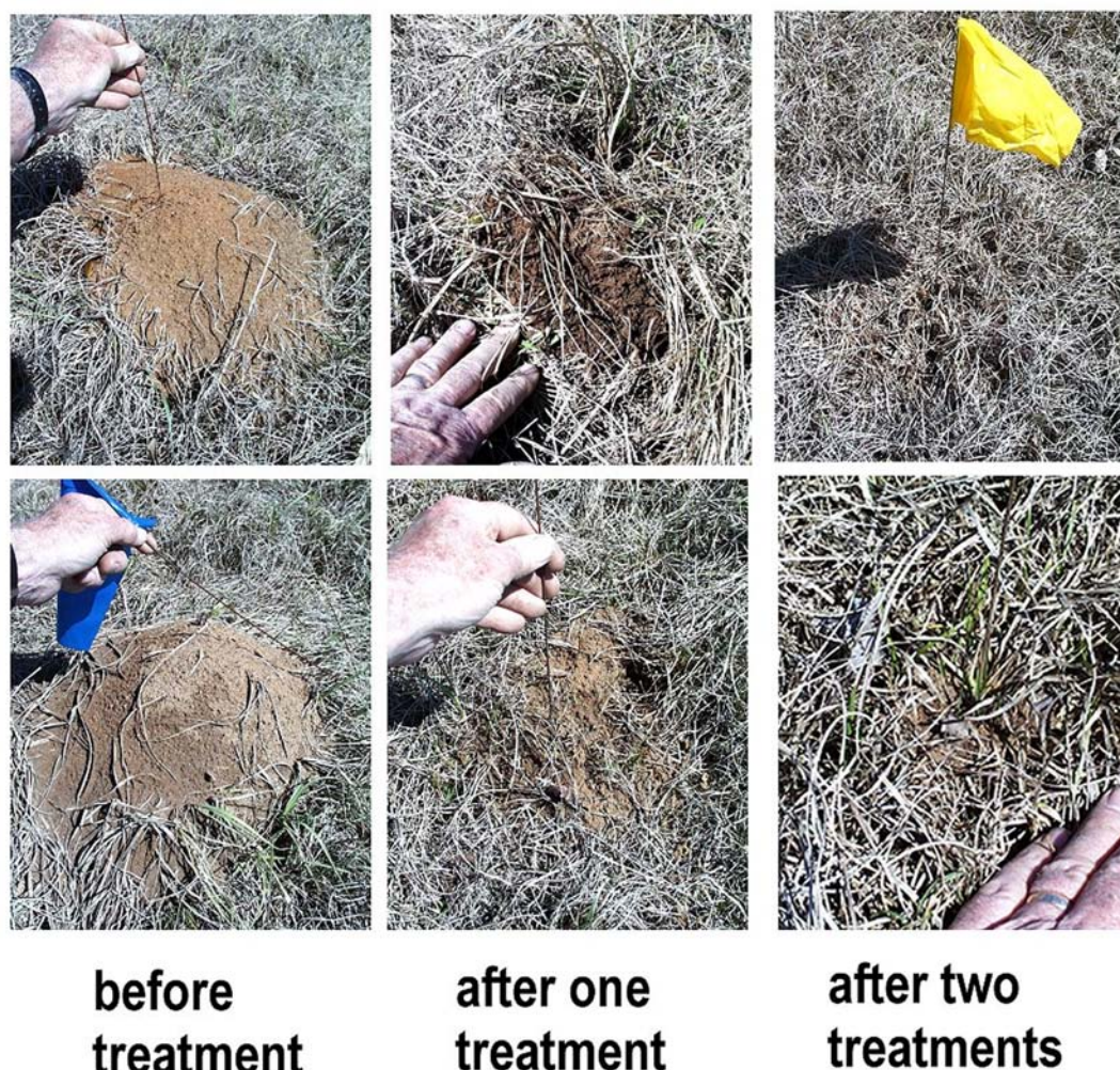
Figure 10. Typical aspects of colonies before treatment with hot water, and after one and two treatments. Most colonies were queenless after one treatment, and had only a few surviving workers, if any, after two treatments.

0.049]. On treatment plots, groups of adjacent perimeter pitfalls often had higher rates of capture suggesting that many of these ants were foraging into the plots from outside them.