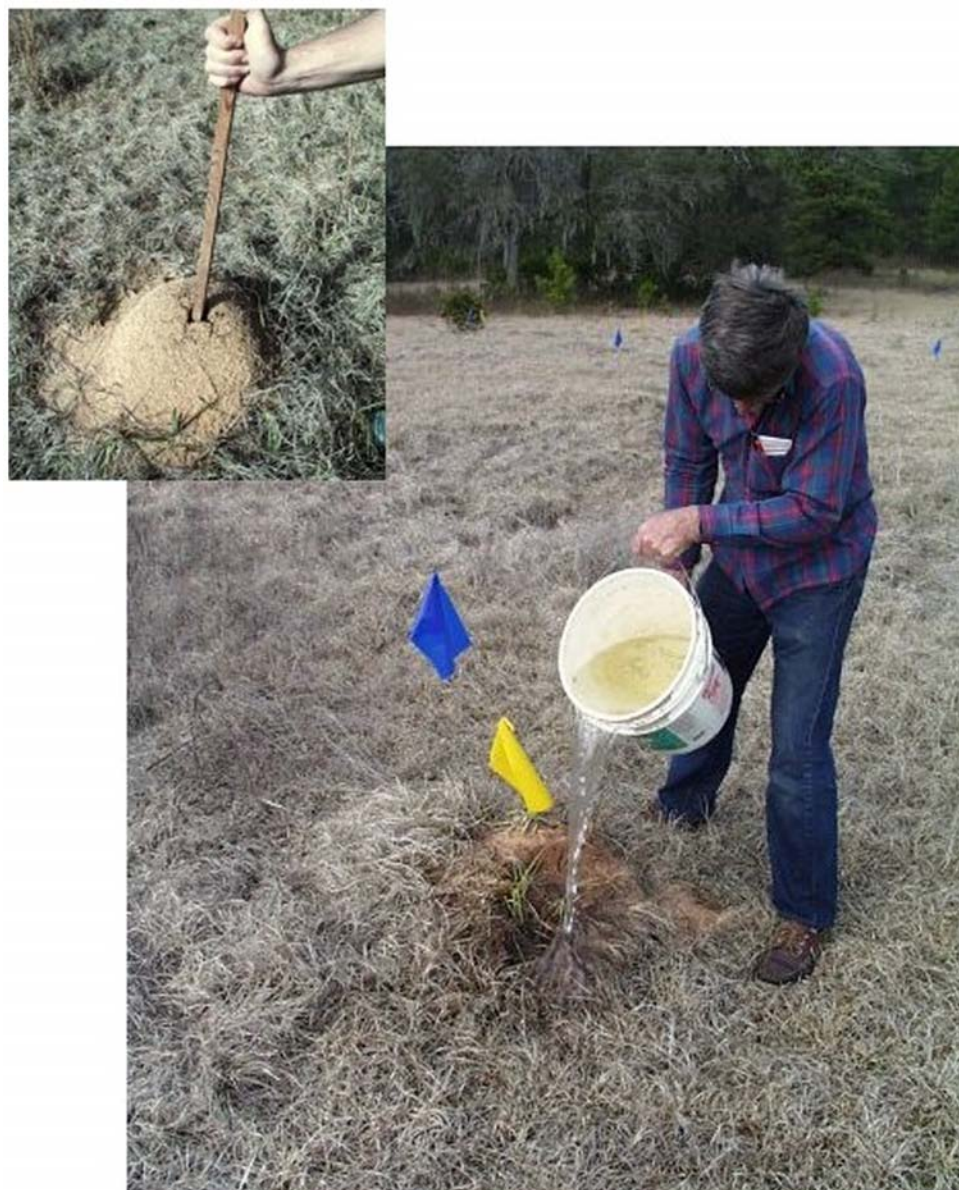
Figure 9. Pouring hot water into a fire ant colony that has been opened by piercing subterranean chambers with a stick.

months after the first year's treatment, all 5 treatment plots together contained a total of 154 colonies, but only 10% (15 colonies; average per plot 3) of these were mature, that is, large to very large. These mature colonies were probably move-ins. All colonies on treatment plots were then treated twice with hot water. Two weeks later 54 (35%) of the 154 colonies were dead, 85 (55%) has some workers but no worker brood, indicating they were queenless, and 13 (8%) had both workers and worker brood, indicating queenright status. All of these colonies were small (Figure 10), and were eliminated with a third hot water treatment. Thereafter, whereas the 5 control plots contained a total of 166 mostly large colonies, the 5 treatment plots contained no live colonies at all.