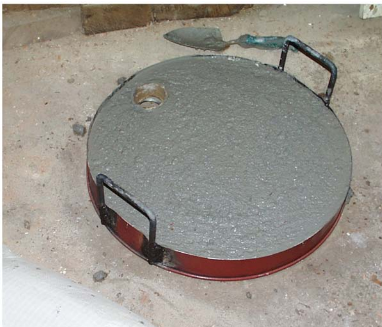
Figure 2. The kiln lid filled with sand/fireclay mixture, before drying and firing.