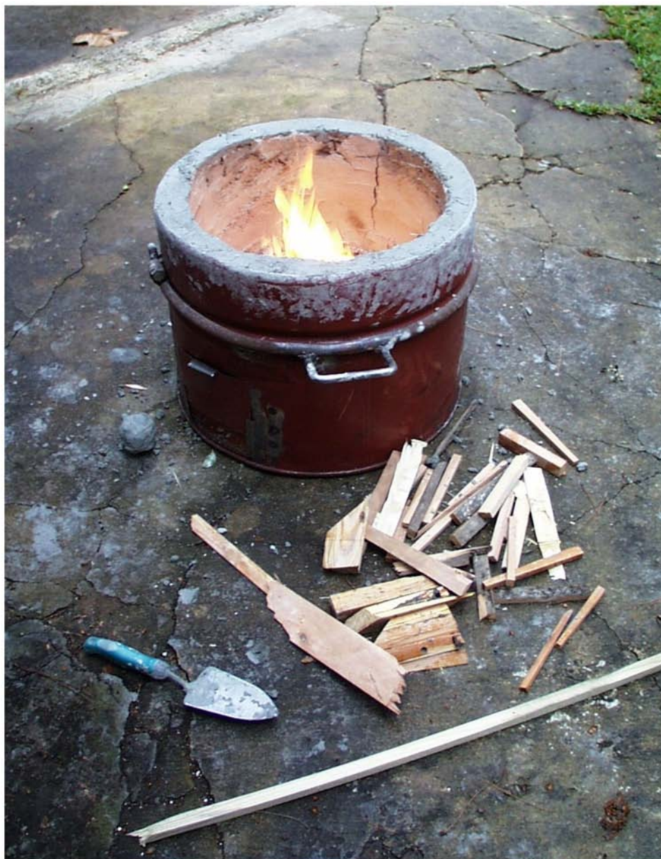
Figure 1B. The lined kiln is being dried with a small fire.

experiment on fire ant population regulation. In both studies, water was heated at a fixed location in a large pot, limiting the number and spatial distribution of treated colonies. In these experiments on fire ants and native ants, treatment plots were widely scattered and contained many hundreds of colonies, making a fixed location, low volume, batch-wise heating system impractical. To meet this challenge, a flow-through charcoal kiln was developed that produces a continuous flow of hot water, limited only by the size of the reserve tank. Here, we report its construction and use over two years to suppress populations of S. invicta .