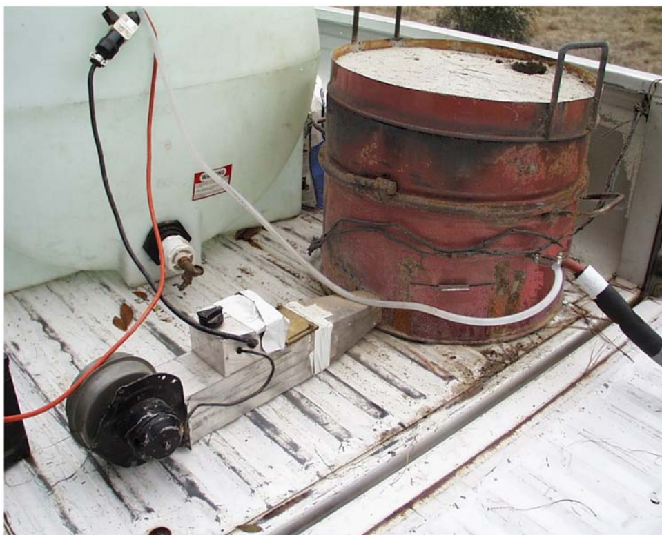
Figure 5. Modified automobile heater fan, powered by a 12-v marine battery. The tapered outlet increases the air velocity entering the bottom of the kiln.