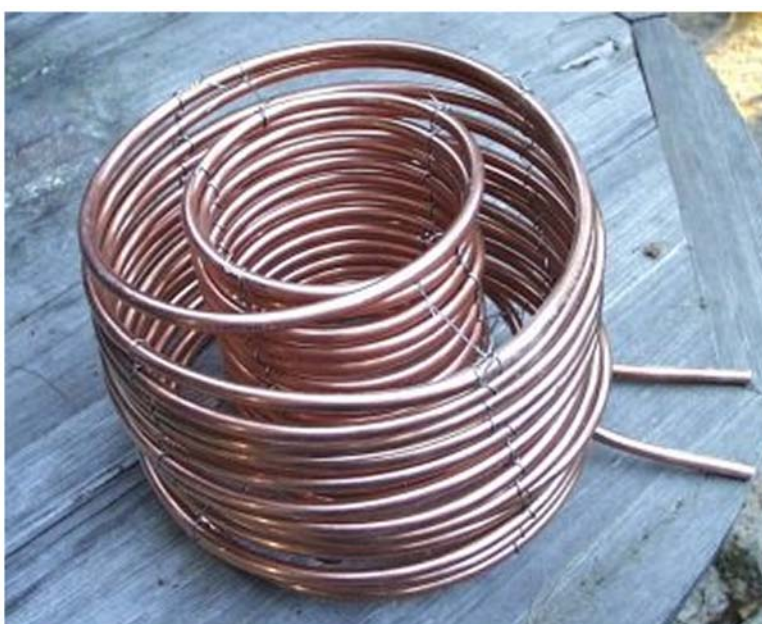
Figure 3. Flow-through copper tubing coil for heating water in the kiln. The loops of the coil are tied together with stainless steel wire.

battery). A door next to the air vent allowed ash cleanout. A lid was fashioned from the top of the oil drum, cut so that a 5 cm rim remained, that was filled with a sand/fire clay mixture for insulation (Figure 2). The filling-bung formed the chimney vent.