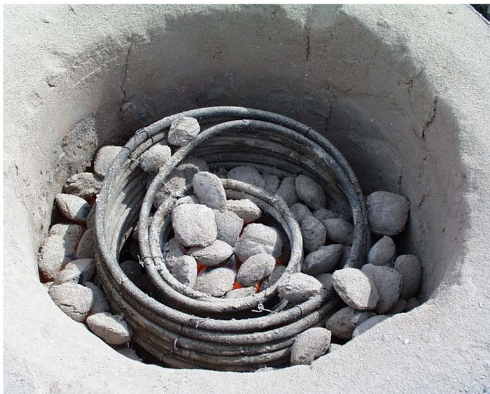
Figure 4. The coil in operation in the kiln, lid removed. Note that charcoal contacts both the inner and outer sides of both coils.