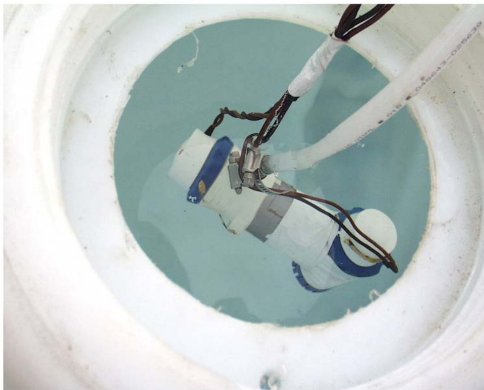
Figure 6. Dual, in-series bilge pumps inside the 225-gallon water tank.

to fit between them (Figure 4). The open ends of the tubing projected through a port in the wall of the kiln. One was connected to the water inflow, and other to the outflow.