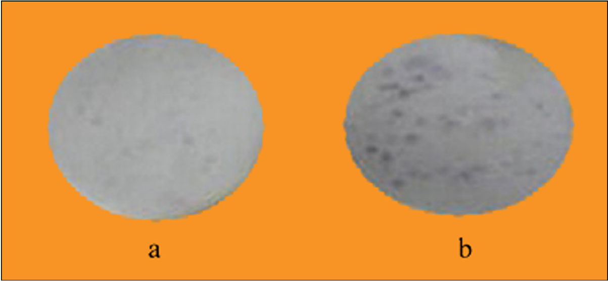
Figure 2. Treatment of Acyrtosiphon pisum during 24 h with flonicamid at 100 µg/ml (a) in the artificial diet reduced markedly the amounts of honeydew produced by aphid nymphs as compared to the untreated control (b) after visualization by use of the Ninhydrin test.