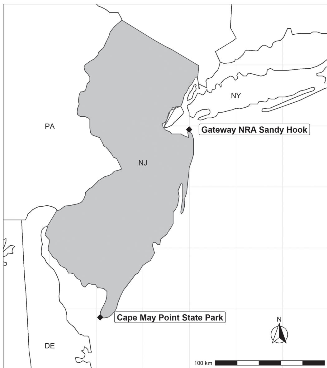
Figure 1. Study area for Black Skimmer ( Rynchops niger ) and Least Tern ( Sternula antillarum ) monitoring from 1976–2019, New Jersey, USA. Monitoring occurred along the entire Atlantic coast from the Sandy Hook Unit of Gateway National Recreation Area to Cape May Point State Park.

cies are listed as state endangered in New Jersey (Davis and Heiser 2020).