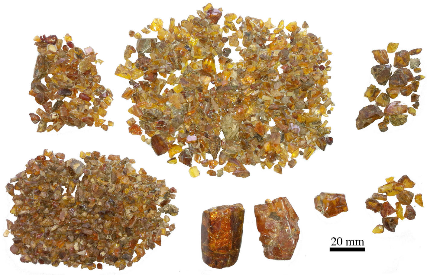
Figure A2. A sample of Vendean amber showing the size and color of various pieces.