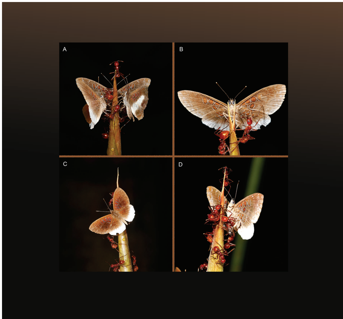
FIG. 5. Adult Adelotypa annulifera putative wing pattern mimicry. (A) Male (left) and female (right) butterflies perched on bamboo shoot in presence of Megalomyrmex balzani ants. View of A. annulifera wing pattern: (B) Ventral (C) Dorsal (D) Lateral.

of time, not unlike when the ants antennate the caterpillars in return for a nectar reward (Fig. 4C), however, extensive observations revealed that the butterflies did not provide any apparent resource for the ants. Thievery of a food source (kelptoparasitism) occurs in many arthropod groups (Eisner et al. 1991; Sivinsky et al. 1999) and in this case, A. annulifera adult butterflies appear to display a kelptoparasitic behavior towards attendant ants by taking a nutritive resource, in this case bamboo sap secretions (Fig. 4D–F).