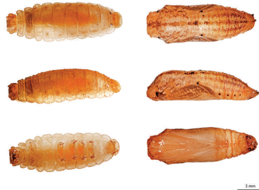
FIG. 3. Final instar larva (left) dorsal, lateral, and ventral view. Presence of tentacle nectary organ (TNO) on abdominal segment 8. Pupa (right) dorsal, lateral, and ventral view.

the eighth abdominal segment which appear similar to those described in Lemonias caliginea (in Ross, 1964, as Anatole rossi ) and Thisbe irenea (DeVries 1988) and one pair of vibratory papillae (VPs) located on anterior border of the prothoracic shield, anteriorly directed, similar in overall appearance to those described by Ross (1964, 1966) and DeVries (1988). Later instar body becomes greenish in color (Fig. 2), head capsule lighter yellow color, general aspects of morphology similar to preceding instars'.