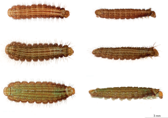
FIG. 2. Dorsal (left) and lateral (right) views of early instar Adelotypa annulifera .