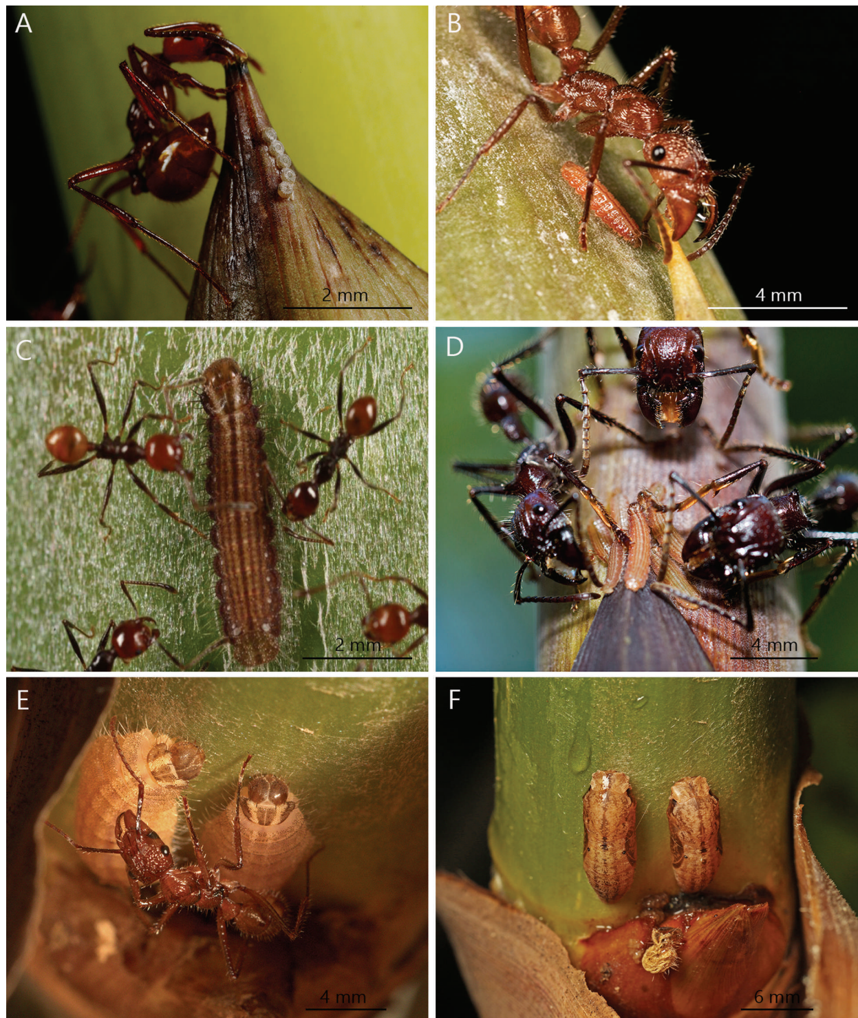
FIG. 1. Immature stages of Adelotypa annulifera on bamboo and their association with ants. (A) Eggs with Megalomyrmex balzani . (B) First instar larva with Ectatomma tuberculatum . (C) Mid-instar larva with Pheidole sp. (D) Mid-instar larvae with Paraponera clavata . (E) Final instar larvae with E. tuberculatum . (F) Pupae.