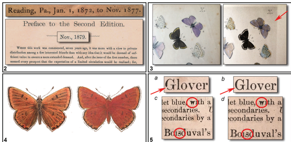
FIGS. 2–5. Features of the first and second editions of Rhopaloceres and Heteroceres . 2. Publication date from the wrapper of the second edition (top), and portion of the preface for same edition. Inset is the date given in the preface. 3. Detail of Plate 10 from the first (left) and second editions. Note gray background on the plate for the second edition (red arrow) and poor quality coloring of the figures. 4. Dorsal figure of male Lycaena rubidus sirius (W. H. Edwards) from Pl. 10 of the first (left) and second editions. This figure is likely based on an existing specimen from Strecker's collection (FMNH), labeled "c" from Colorado. 5. Comparison of letterpress between the first and second editions: a , imperfect "G" from pg. 5 of first edition; b , corrected "G" from same page in the second edition; c , d , defective "w" and imperfect "s" from pg. 89 of both editions.

Books and Apparatus in connection with Natural History."