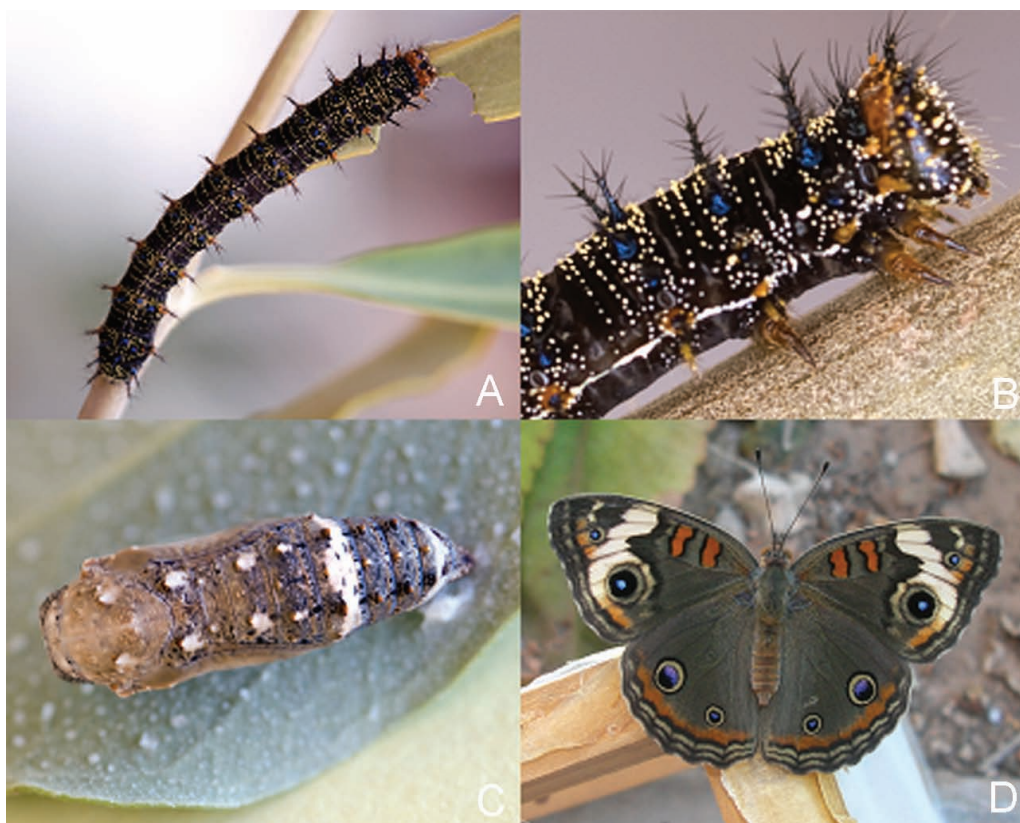
FIG. 2. Developmental stages of Junonia genoveva from Estero del Soldado. (A) last instar larva feeding on its host plant Avicennia germinans ; (B) head and thoracic region of last instar larva; (C) pupa attached to underside of a leaf of A. germinans (salt deposits are visible on leaf); (D) recently-eclosed female being released.