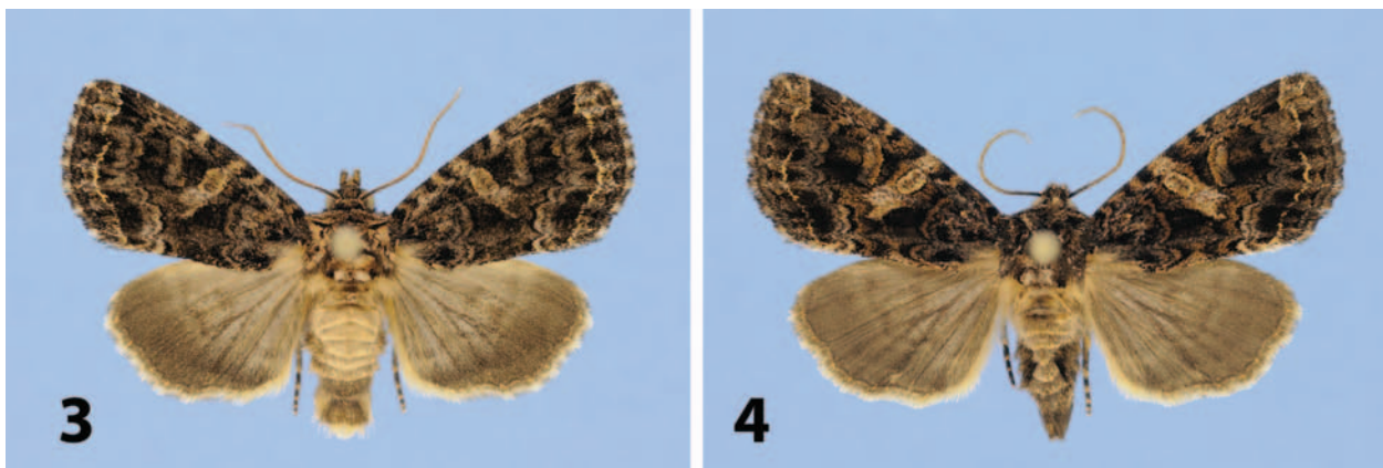
FIGS. 3-4. 3) Hadena ectypa , adult male, reared in 2009. Wingspan 28.5 mm. 4) Hadena ectypa , adult female, reared in 2010. Wingspan 30.0 mm.

The Knightville WMA was revisited on 15, 18, and 20 July 2010. On 15 July 2010, at the same site where Hadena ectypa was found on 28 July 2009, five large Silene vulgaris plants were thoroughly searched, with hundreds of flowers examined. A total of 25 Hadena ectypa larvae were found (two in the second instar and 23 in the third instar), as well as seven shed head capsules (one from the first instar and six from the second instar), and two empty eggshells (both inside the same flower). Two second instar and six third instar larvae were collected for rearing. On 18 July 2010, the river banks to the north were searched, but the only sign of Hadena ectypa was a single empty eggshell on one of six S. vulgaris plants about 800 m north of where Hadena ectypa was found on 15 July. On 20 July 2010, the river banks to the south were searched. At one site