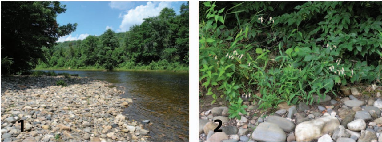
FIGS. 1-2. 1) Habitat of Hadena ectypa at the Knightville State Wildlife Management Area, town of Huntington, Hampshire County, Massachusetts, USA. This stretch of the Westfield River has a rocky substrate, with margins of accumulated cobble and sandy soils, which support a narrow strip of herbaceous vegetation between the river and the floodplain forest. Photographed 28 July 2009. 2) Bladder campion, Silene vulgaris , growing on the sandy river bank behind the cobble bar in Fig. 1. Hadena ectypa was collected from this plant. Photographed 28 July 2009.

bank behind a cobble bar. The habitat (Fig. 1) and S. vulgaris (Fig. 2) were photographed at this location. Most of the S. vulgaris flowers were just past peak, with petals still present and ovaries small and green. Careful examination of flowers at this stage revealed the presence of Hadena ectypa : four first instar larvae, each in its own flower, and two unhatched eggs, both laid on the ovary of a single flower. All four larvae and both eggs were collected for rearing. Also observed on 28 July 2009 were a number of small syrphid flies (Diptera: Syrphidae), including one mating pair, on and around the S. vulgaris . In addition, syrphid fly larvae were observed on the S. vulgaris flowers. On 3 August 2009 the Knightville WMA was revisited in order to determine if the Hadena ectypa population extended further to the south of areas explored previously. At a site on the west bank of the river, approximately 2.6 km to the south of where Hadena ectypa was found on 28