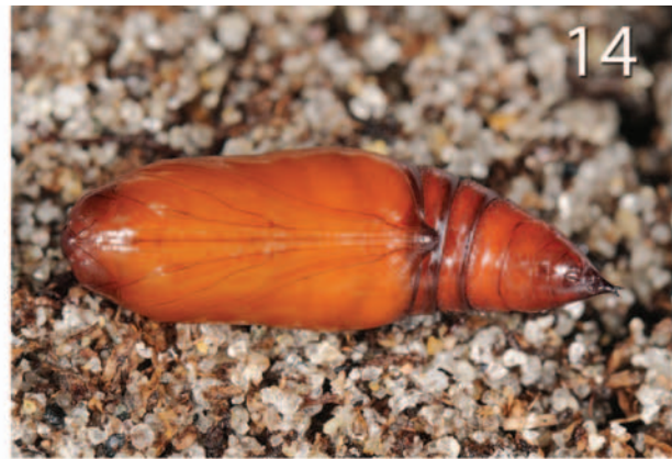
FIGS. 13-14. 13) Hadena ectypa , pupa, lateral. Length 16 mm, width 5.0 mm at third abdominal segment. Photographed 20 August 2009. 14) Hadena ectypa , pupa, ventral. Length 15 mm, width 5.0 mm at third abdominal segment. Photographed 7 August 2010.