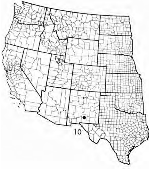
FIG. 10. Chionodes hedgesorum distribution map. Chionodes hedgesorum is known only from White Sands National Monument, Otero Co., New Mexico.

key characters, and descriptions which allowed me to focus on the features of each species which either included it or excluded it from consideration as I distinguished C. hedgesorum . When I sent photographs of the adult and genital preparations to Ron Hodges, he agreed with my diagnosis. One male specimen of C. hedgesorum has a hint of orange in the yellow area of the forewing.