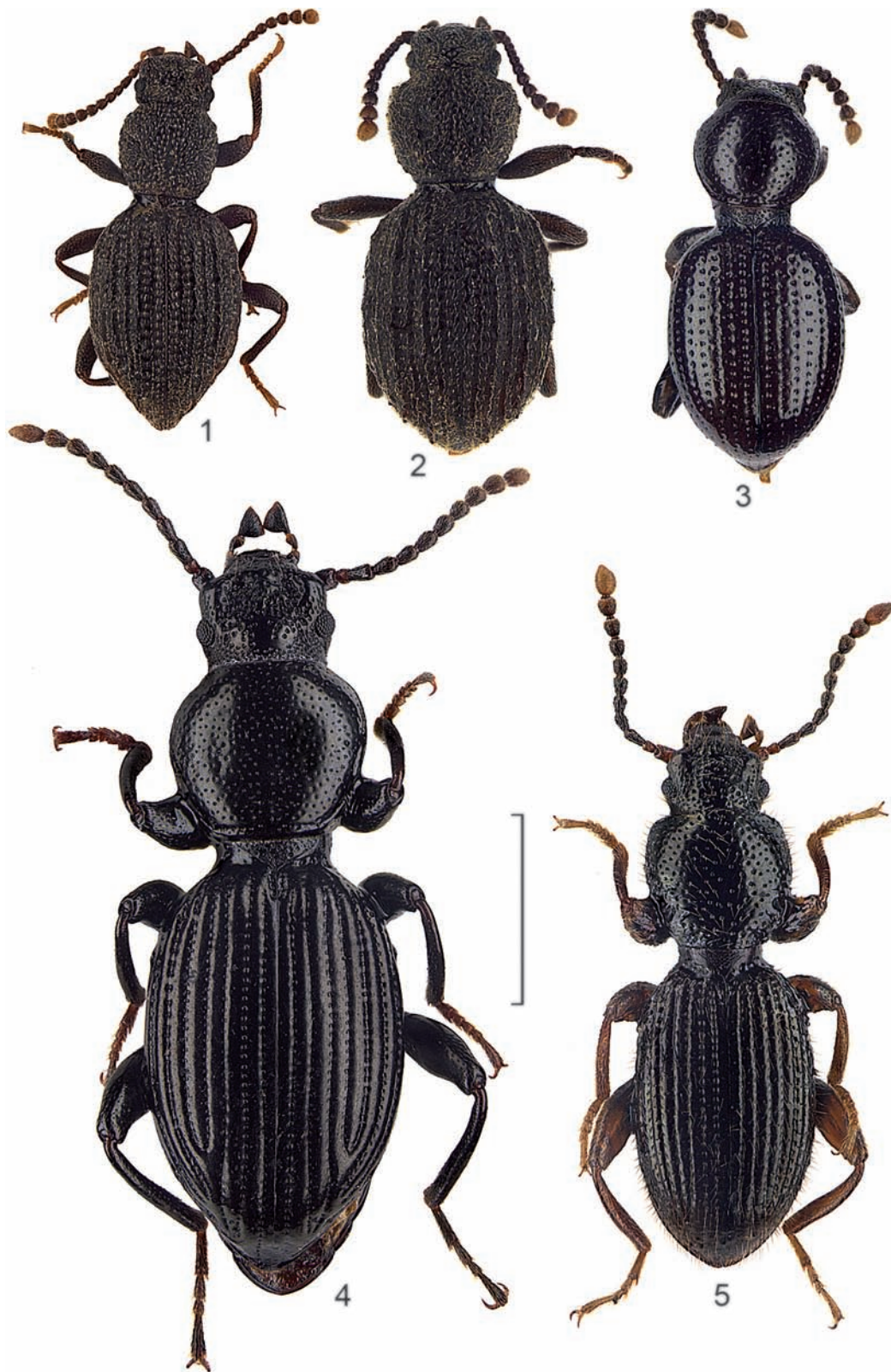
Figs. 1–5. Dorsal view of Laena species from southeastern Asia. – 1. L. bomdilaica n. sp., holotype NMP. 2. L. fikaceki , paratype SMNS. 3. L. monpa n. sp., holotype NMP. 4. L. mandalayica n. sp., holotype NHMW. 5. L. schillhammeri n. sp., holotype NHMW. – Scale: 2 mm.