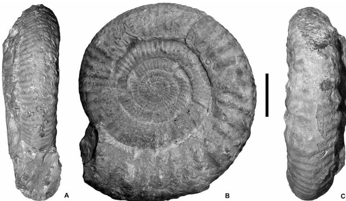
Fig. 1. Graefenbergites cf. arancensis (MELÉNDEZ, 1989), SMNS 70443. Semimammatum Horizon, Semimammatum Subzone, Hypselum Zone (Upper Oxfordian), Plettenberg Quarry near Balingen, Baden-Württemberg. A: ventral view, B: lateral view, C: ventral view opposite to A. Scale bar = 20 mm.

Material: SMNS 70443, probably a complete or nearly complete phragmocone, three-dimensionally preserved steinkern (Fig. 1A–C), found and mechanically prepared by the authors.