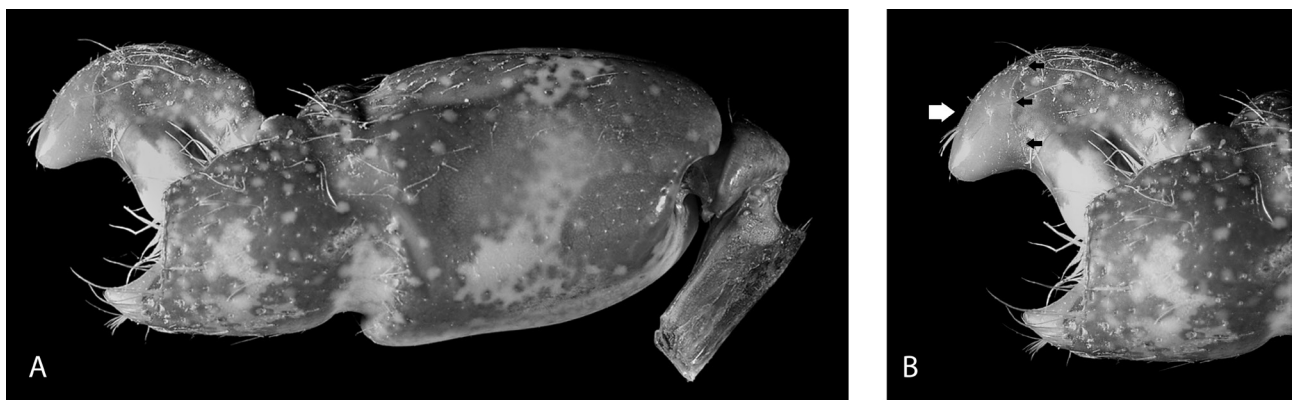
Fig. 3. A – Left major cheliped of an extant Alpheus sp., from the Cortez Sea, Puerto Peñasco (Mexico). B – Close-up of the left major cheliped of the previous extant specimen, showing the strong hardened distal tips of the dactylus (white arrow), with the posterior sinuous margin (black arrows).

FELDMANN et al. 2019). We cannot exclude, however, the possible belonging of the studied strongly calcified claw fingertips to the fossil and extant genus Alpheus , based upon the results reported by HYŽNÝ et al. (2017: table 1) that all samples from the Cenozoic (late Oligocene, Miocene, and Pleistocene) of United States (Alabama), Europe (France, The Netherlands, Austria, Poland, Slovakia, and Czech Republic), Africa (Egypt), and Asia (Japan) have been assigned to Alpheus sensu stricto . Anyway, more detailed analyses of additional material are essential in order to better clarify their real significance, since the areal distribution of these mesofossils is actually undervalued in the Pliocene of Italy (G. PASINI, pers. obs. 2018), based on previous misidentifications or the lack of formal reports.