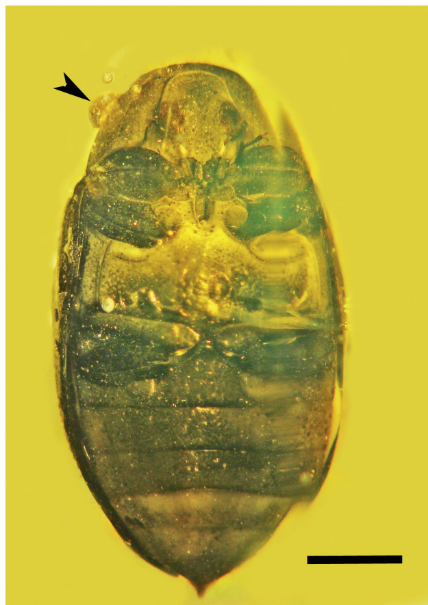
Fig. 2. Ventrum of Chelonarium dominicanum sp. nov. in Dominican amber. Arrowhead shows attached mite. Scale bar = 1.4 mm.

Differential diagnosis: The size, rounded clypeus with a small, blunt projection at the tip, flat pronotal disc with lateral margins extending over the head and the protibia much wider than the adjacent profemur and mesotibia, separate the present species from previously known amber specimens of the family (ALEKSEEV 2019; KIREJTSHUK & AZAR 2013). The hemispherical pronotum and absence of punctulate striae on the elytra separate C. dominicanum from the subtriangular pronotum and punctulate striae on the elytra of the Eocene Florissant species Chelonarium montanum WICKHAM (1914).