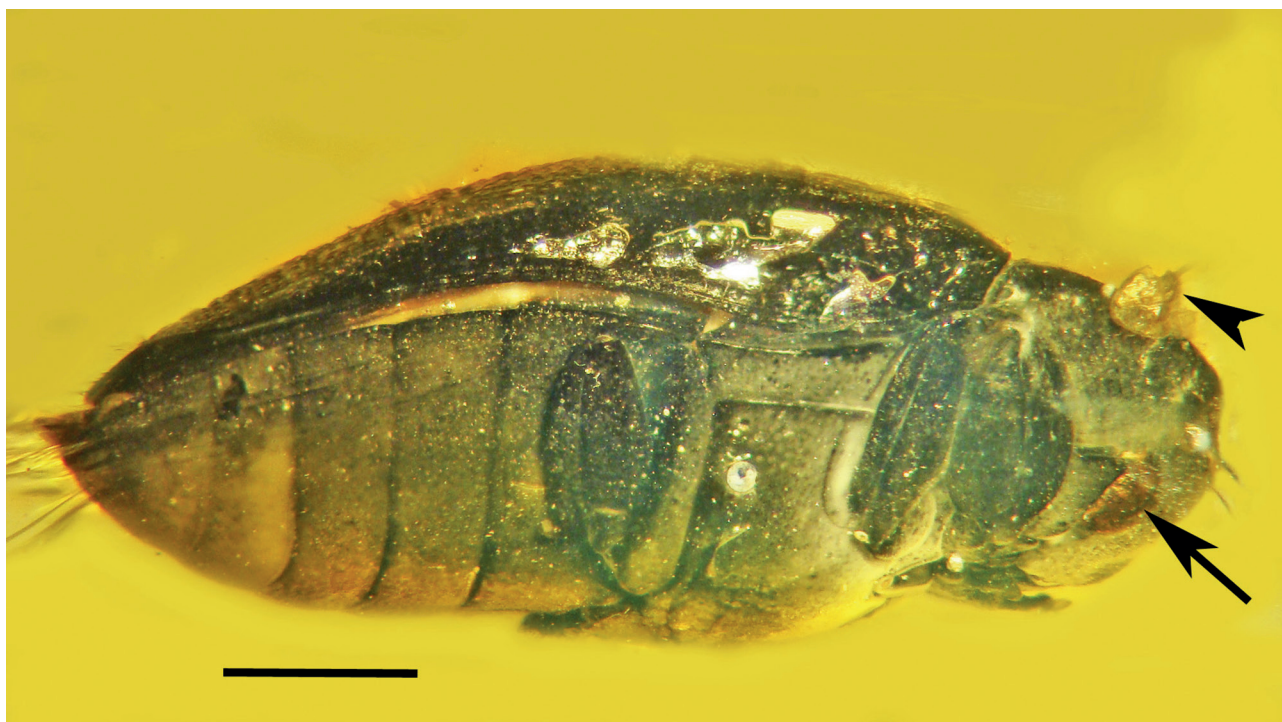
Fig. 3. Lateral view of Chelonarium dominicanum sp. nov. in Dominican amber. Arrow shows eye. Arrowhead shows phoretic mite on pronotum. Scale bar = 0.9 mm.