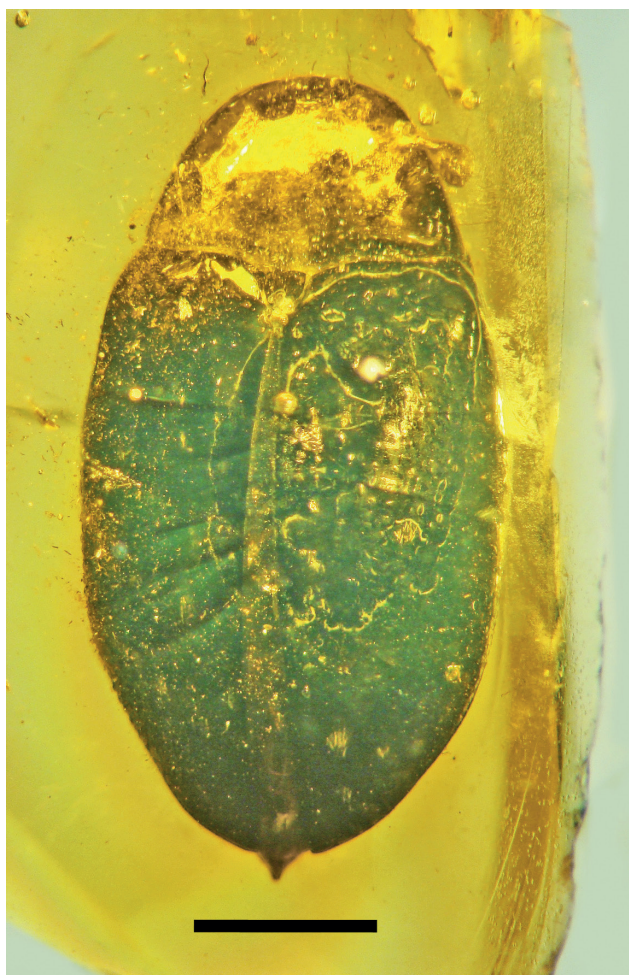
Fig. 1. Dorsum of Chelonarium dominicanum sp. nov. in Dominican amber. Scale bar = 1.3 mm.

Type: Holotype (unknown sex). Accession # C-7-403 deposited in the POINAR amber collection maintained at Oregon State University. Syninclusions include minute organic particles and a phoretic mite attached to the specimen.