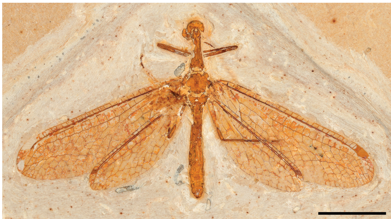
Fig. 1. Karenina cuneiformis sp. nov., holotype, OMNH TI 530 (part). – Scale: 10 mm.

Forewing elongate-oval, rounded apex, 28 mm long, 8.4 mm wide (length/width ratio 3.3). Costal space narrow, composed of 35 cells, humeral veinlet stout and apparently cuneiform in shape with slightly semi cylindrical (Fig. 3b), all subcostal veinlets simple, pterostigma preserved. Sc fused with RA distad, veinlets of Sc + RA simple, three veinlets connected by crossveins. Subcostal space very narrow, crossvein not detected. Stem of RP straight, origin inclined at acute angle to RA. RA space (between RA and RP) broadest at proximal third, narrowed distad, with 20 (right wing) and 17 (left wing) cells. RP divided into nine zigzagged branches, forked only marginal forks. Radial crossveins numerous, forming irregular gradate series, partly reticulate. No crossvein between stem of RP and M. M basally fused with R nearly humeral veinlet, divided into MA and MP; MA arched, slightly zigzagged distally; MP slightly zigzagged. Basal crossvein m-cu located slightly distal to origin of M. Cu originated at wing base, divided into CuA and CuP at basal crossvein m-cu; CuA straight proximally, connecting stem of MP and first intramedian cell (im), strongly zigzagged distally with terminal branches; CuP relatively short, with terminal fork; two crossveins between CuA and CuP. Anal vein poorly preserved, two crossveins between CuP and A1.