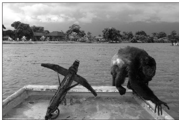
Figure 2. Photograph of the adult male mantled howler ( Alouatta palliata ) in Cuero y Salado Wildlife Refuge, Honduras, shortly after it climbed onto the front of research boat (7:38 am, 7/21/2005). The dugout canoe that first encountered it swimming can be seen on the top right and several buildings from the Salado village on the eastern shore on the left. The boat is traveling upriver heading southeast.