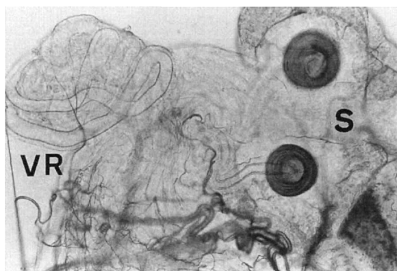
Fig. 1a. Normal spermathecae (S) in the control strain, Canton-S. VR: ventral receptacle.