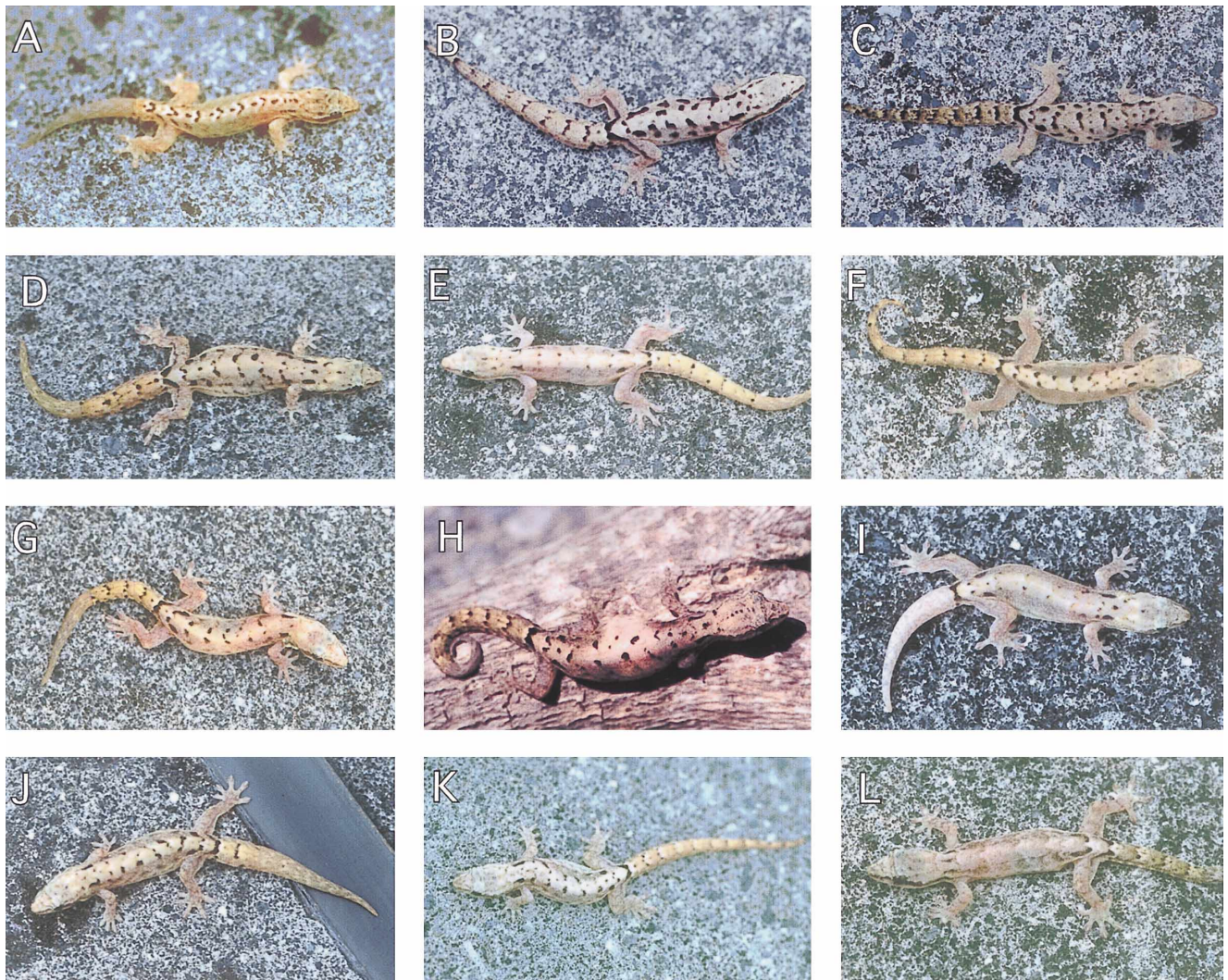
Fig. 4. Dorsal patterns of Lepidodactylus lugubris from the Daito Islands. A: clone Da from Minamidaito-jima (KUZ 48533). B: clone B from Kitadaito-jima (KUZ 48466). C: clone B' from Minamidaito-jima (KUZ 48482). D–J: clones BI-1–BI-7 from Minamidaito-jima (KUZ 48658, 48460, 48483, 48637, 34738, 48653, and 48638, respectively). K: clone BI-8 from Kitadaito-jima (KUZ 48530). L: clone N from Minamidaito-jima (KUZ 48463).