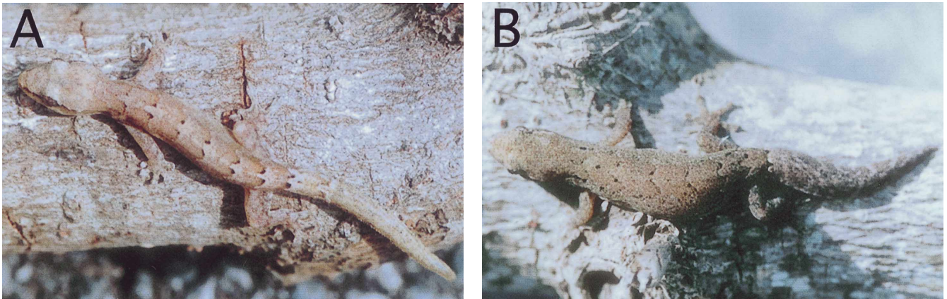
Fig. 3. Dorsal patterns of Lepidodactylus lugubris from the Ogasawara Islands and the Ryukyu Archipelago. A: clone A from Haha-jima (KUZ 47063). B: clone C from Zamami-jima, Okinawa Islands (KUZ 34867).