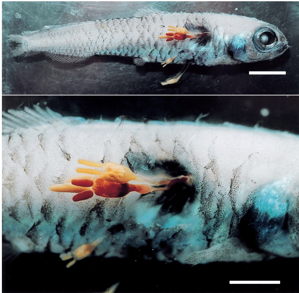
Fig. 1. A deep-sea smelt, Bathylagus antarcticus Günther, from the Antarctic Ocean infected with four sphyriid copepods, Paenocanthus antarcticensis (Hewitt). Upper photo shows the whole fish and lower photo, the infected area (fourth parasite showing only a portion of its neck). Scale bars: upper=10 mm, lower=20 mm.

state that the parasite P. antarcticensis has not been seen with certainty since its discovery in 1965 and only three specimens [two in Hewitt's (1965) original description and one in Kabata's (1965) report] of the species are known to science so far.