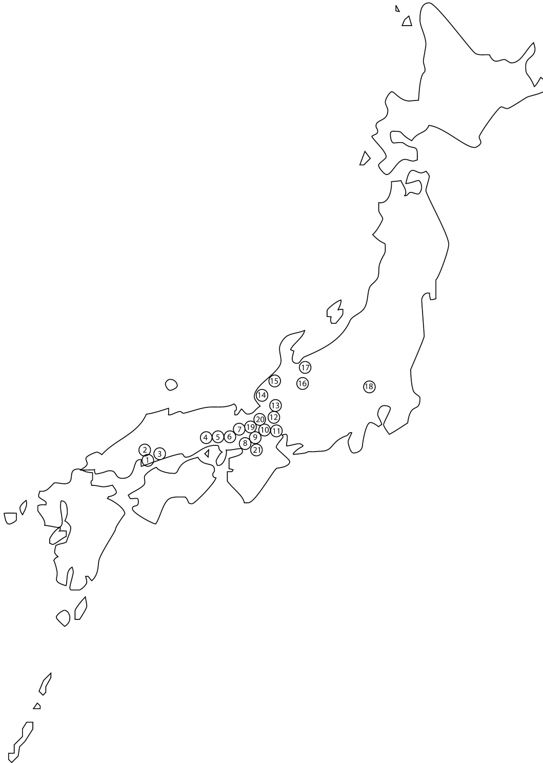
Fig. 1. Map of Japan showing the distribution of sampled Pristionchus species. Locations; 1: Hiroshima, Kawajiri-cho, Norosan, 2: Hiroshima, Kumano-cho Hagiwara, 3: Hiroshima, Mihara-shi, Kui, 4: Hyogo, Himeji-shi, Shiratori, 5: Hyogo, Miki-shi, Kasa, 6: Hyogo, Miki-shi, Yoshikawacho, Kamiarakawa, 7: Hyogo, Sasayama-shi, Jyonan, 8: Hyogo, Amagasaki-shi, Mokawa, 9: Osaka, Takatsuki-shi, Karasaki, 10: Kyoto, Hachiman-shi, Nishiyama, 11: Kyoto, Jyoyo-shi, 12: Shiga, Otsu-shi, Hieidaira, 13: Shiga, Otsu-shi, Hieidaira, 14: Hukui, Obama-shi, Anou, 15: Hukui, Minami-echizencho, Nanjyo, 16: Gifu, Gunjyou-shi, Takawashi-cho, 17: Toyama, Oyabe-shi, 18: Gunma, Shibukawa-shi, Ishihara, 19: Osaka, Takatsuki-shi, Tsutsumicho, 20: Osaka, Takatsuki-shi, Tsutsumicho, 21: Nara, Kasuganocho, Kasugataisha.